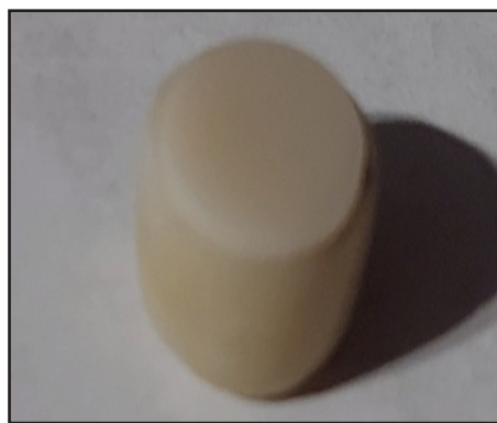
Figure (1): Ceramic disc cemented to composite substrate

A layer of resin cement was put between ceramic discs and substrate (Fig.1). Type of resin cement was translucent resin cement (Choice™ 2, light cured veneer cement, Bisco). Cementation was done with application of 250 g load for 20 second using cementation device to make initial curing and get a uniform thickness of cement, then the load was removed for further curing for another 20 seconds.