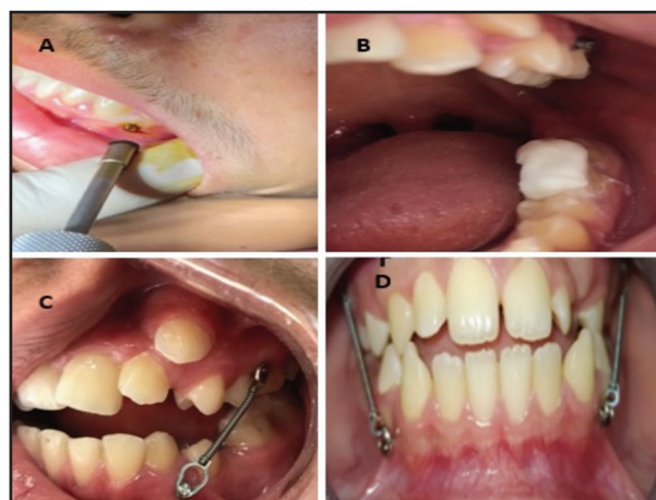
Figure (1) Steps of miniscrew placement and application of coil spring (A) Insertion of miniscrew in the alveolar bone. (B) Placement of fixed posterior bite plate. (C) Modified TAD coil spring placement. (D) Bilateral coil spring placement.

Immediately before insertion, the area of placement swapped with 10% povidone-iodine ^ , Moreover 1mm of local anesthesia solution injected in the mucogingival sulcus adjacent to the placement area. After the area became anesthetized, gingiva was bunched by periodontal probe producing bleeding point which indicates the exact site of the miniscrew insertion.