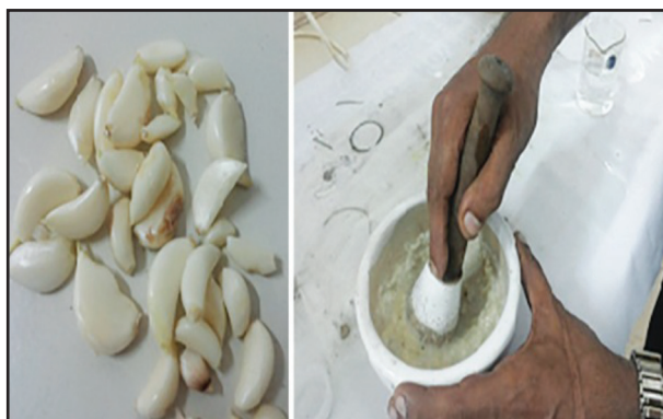
Figure (1) Preparation of garlic

a juice extractor and added to the garlic extract. Authorized additive, peppermint flavor (1 gm/L), sodium saccharine (1 gm/L), as sweetening agent, and sodium bicarbonate (0.5 gm) as preservative were added, and the mixture were mixed properly to prepare a mouth wash. (Fig1)