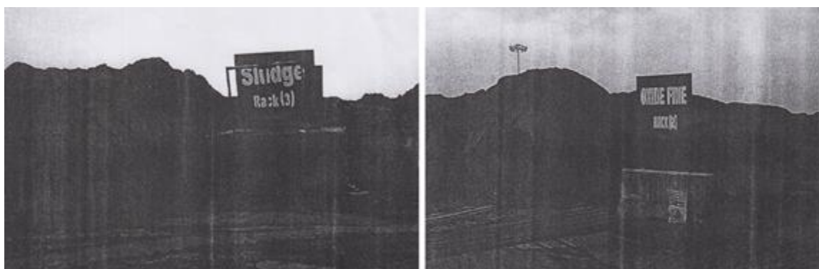
Figure (2) Highly rich iron oxide wastes in the back yard of EZDK Company

This waste material is accumulated in the back yard of EZDK Company in Alexandria, as shown in Fig. (2).