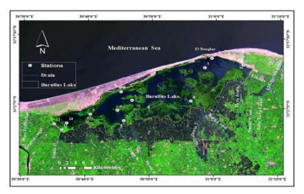
Fig. (1): Map showing sampling stations in Lake Burullus.