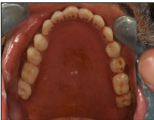
Figure (1): maxillary single denture

nearly parallel to ground. During test performance, the subjects were verbally encouraged to perform at their best. The patient was instructed to bite forcefully in maximum intercuspation. Three bite force recordings were carried out at 30 second intervals for each muscle testing. A computerized system was used for recording and analysis of electromyographic data. Each of the three recordings was analyzed for peak amplitude and duration of the longest wave and was subjected to statistical analysis. Following completion of EMG recordings, the maxillary and mandibular dentures were relined with silicone based denture liner.