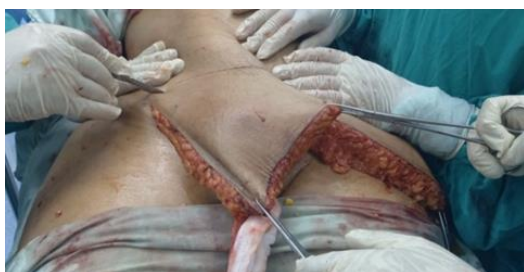
Fig. 8: Towel clips are placed at the tips of the flaps to apply gentle suture before flap excision

It is forbidden to detach the the flap beyond costal margin to preserve its vascularity, but gentle cannula dissection is allowed to get more flap mobility and eliminate tissue ridge without affecting blood supply. This keeps the fibrous septa which contain vascular perforators. then we simulates linea alba of the youthful abdomen by traction sutures with Vicryl 2/0 in the midline. (Figure 9)