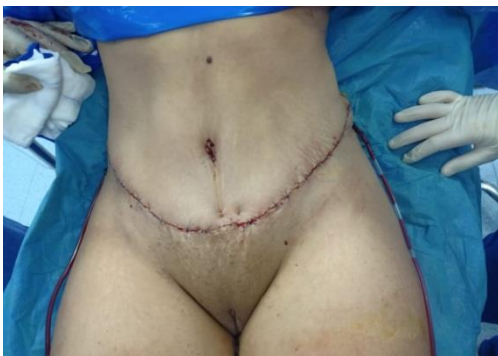
Fig. 10: Immediate post-operative

Then we final revision of hemostasis before stay sutures to distribute tension. 2 drains put laterally then is skin closed by suturing of scarpa's fascia, which is important layer and must be closed under maximum tension to relieve the overlying layers, it is closed with 0 vicryl suture. Upper flap is advanced medially to eliminate any dog ears then deep dermal 2/0 vicryl sutures is put before final sub cuticular 4/0 prolene sutures. Then we dress the wound and dress the pressure bandage.