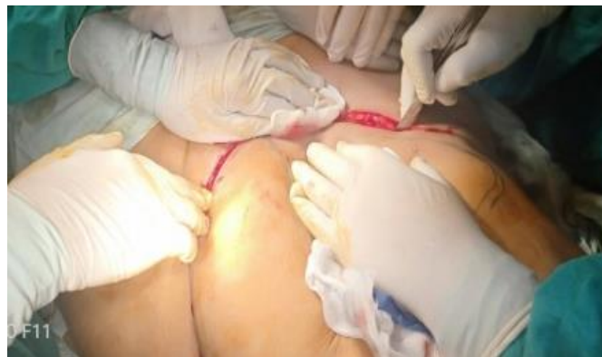
Fig. 4: Transverse incision of formerly marked is made with 15 blade

infero-superior to preserve much perforators. Then the incision made with 15 blade, it is better to be located 2 centimeters below the marked line to overcome the later upward scar migration. I.V fluid is infused for compensation of liposuction aspirate and blood loss.