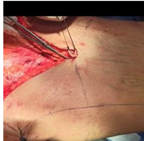
Fig. 6: umbilicus separation

Dissection beveled through the fat of the skin flap till reaching the rectus sheath at appoint midway between the umbilicus and the symphysis, this preserves more lymphatic's and decreases seroma formation . Meticulous homostasis should be done along the course of dissection. The Umbilicus then raised vertically with 11 blade and dissection scissors. The upper and lower poles of umbilicus are marked by threads, dissection is continued up to costal margins and xiphoid. Then we plicate rectus abdominis muscle sheath by marking its medial border by methylene blue. This defines the diastasis, plication is don from xiphoid process superiorly and symphysis inferiorly, and laterally from medial border of recti , plication is done by zero or 1 nilon looped suture, in one or two layers according to situation, At the level of the pubic symphysis, the knot tied and buried. Now it is time for flap resection, the patient is put in semi setting position by tilting operation table. The table is tilted in forty five degrees to release tension off of the wound closure and allow excision of maximum skin excess (Figure 8).