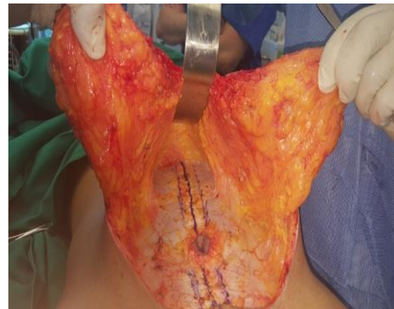
Fig. 7 Wide rectus abdominal muscle placcation

Dissection beveled through the fat of the skin flap till reaching the rectus sheath at appoint midway between the umbilicus and the symphysis, this preserves more lymphatic's and decreases seroma formation . Meticulous homostasis should be done along the course of dissection. The Umbilicus then raised vertically with 11 blade and dissection scissors. The upper and lower poles of umbilicus are marked by threads, dissection is continued up to costal margins and xiphoid. Then we plicate rectus abdominis muscle sheath by marking its medial border by methylene blue. This defines the diastasis, plication is don from xiphoid process superiorly and symphysis inferiorly, and laterally from medial border of recti , plication is done by zero or 1 nilon looped suture, in one or two layers according to situation, At the level of the pubic symphysis, the knot tied and buried. Now it is time for flap resection, the patient is put in semi setting position by tilting operation table. The table is tilted in forty five degrees to release tension off of the wound closure and allow excision of maximum skin excess (Figure 8).