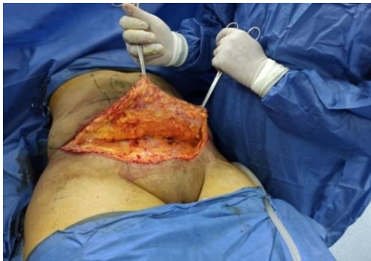
Fig. 5: bevel dissection through the fat of the skin flap

Diathermy is utilized to open the dermis and to coagulate the blood vessels. (Figure 5).