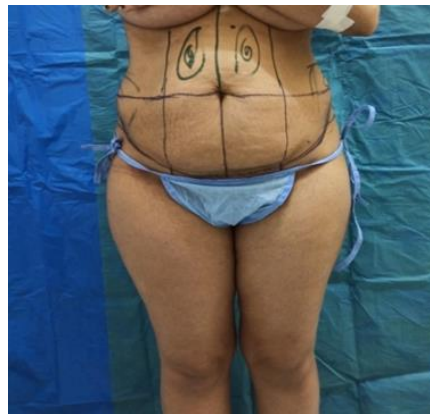
Fig. 1: Preoperative markings are made with the patient standing.

We marked the incision line while patient standing; 7 cm above superior vulvar commissure. This mark is prolonged laterally, along skin crease while patient manually elevate her belly. The length and region of this proposed incision and liposuctions is then measured to make certain symmetry. (Figure 1,2).