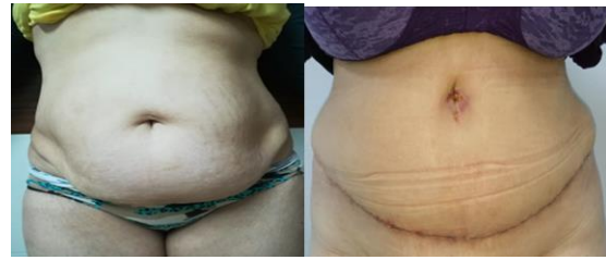
Fig. 11: Pre and post-operative view of liposuction assisted extended abdominoplasty

The weight of excised skin and subcutaneous fat in the 10 cases under group (A) ranged from 2500 to 4000gm. with a mean of 3.070 kg. Operative time was ranged from 3.5 to 5 hours with a mean of 4 hours. The volume of Aspirate in 10 cases ranged from 3000 to 4000 cm with mean of 3.6 liters each case. The total drain output in the 10 cases under group (A) ranged from 600 to 1500 ml. with a mean of 885 ml per case. The days needed for drains removal in the 10 cases under this group ranged from 3 to 7 days with a mean of 4.8 days per case. The days of hospital stays in the 10 cases under this group ranged from 2 to 7 days with a mean of 3.8 days per case. Bad patient satisfaction occurred in one patient showed recurrent protrusion of ant. Abdominal wall which needed revision.