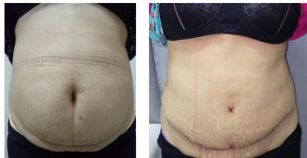
Fig. 12: Pre and post-operative view of liposuction assisted full abdominoplasty

Operative time was ranged from 2.5 to 4 hours with a mean of 3.25 hours. The weight of excised skin and subcutaneous fat in the 10 cases under group (b) ranged from 2000 to 3000g, with a mean of 2.37kg. The total aspirate volume in group B ranged from 3000 to 4000 ml, the mean was 3.65. The total drains output in the 10 cases under group (B) ranged from 3000 to 4000ml. with a mean of 676.5 per case. The total days needed for drain removal in the 10 cases under this group ranged from 2 to 3 days with a mean of 2.9 days per case. The total days of hospital stays in the 10 cases under ranged from 2 to 3 days with a mean of 2.9 days per case. Fair patient satisfaction was achieved in single case (5%) due to asymmetric scar along the incision line. Others are fully satisfied.