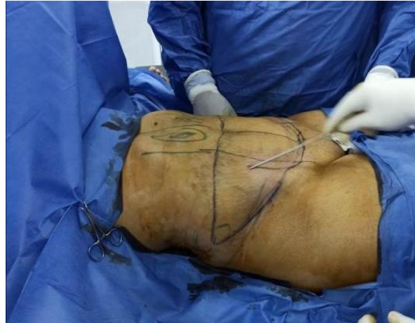
Fig. 3: Traditional liposuction with 4 mm diameter cannulas

loose areolar tissue between abdominal wall and skin flap to make easier dissection with 3mm infiltration cannula till achieving tissue turgor. 20 minutes later the liposuction of deep plane started with 4 mm cannula, then final refining with 3mm cannula