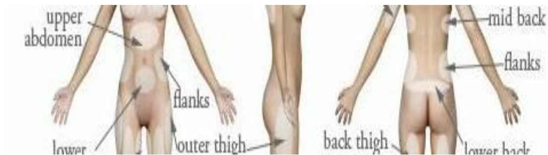
Fig. 2: All areas for liposuction are marked this includes; the entire central abdomen, flanks, and hip rolls.

Lateral part of the incision is marked and agreed by the patient then the proposed upper incision is identified and marked by pinch test.