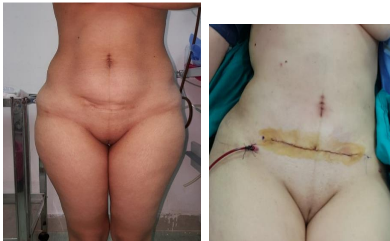
Figure (13) pre and post-operative view of liposuction assisted mini-abdominoplasty

worldwide percent with traditional abdominoplasty alone was 50, 3.8, 5.1 for seroms, epithiliolysis and dihescence respectively as published by saldanha2007 Although the incidence of hematoma was reduced to 0 compared to 0.6 percent and the incidence of deep venous thrombosis/pulmonary (0 percent compared to 0.2 ), we cannot consider these findings as statistically significant due to the small number of cases.