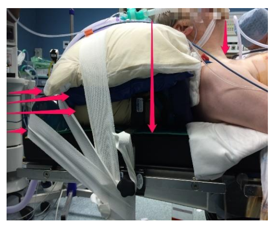
Figure [2]: Head pillows and Head ring

The patient was then placed in the Supine-Trendelenburg-Lithotomy position before engaging the robot, where we used four head pillows and head ring with several of Pressure Relief Gel Pad and an adult Gel Chest Rolls put under the pillows fixed with Elastoplast adhesive bandage 8 CM X 2.5 [Figure 2]. Operative procedure had been completed as described elsewhere<sup>[11]</sup>.