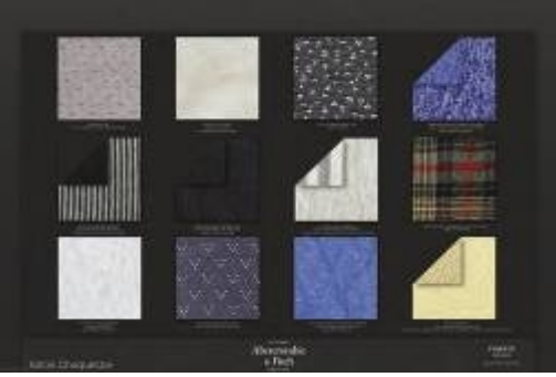
Fig. 5. Textile presentation page for an interview with Abercrombie & Fitch.