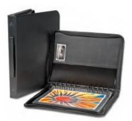
Fig. 1. Basic portfolio case with a multi-ring binder system.