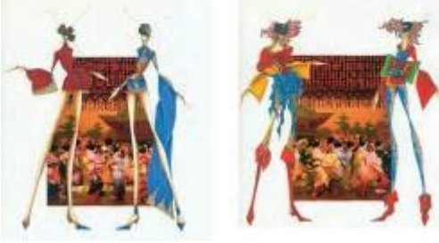
Fig. 6 . Color presentation spread with additional pages of title, mood, and textile presentation.