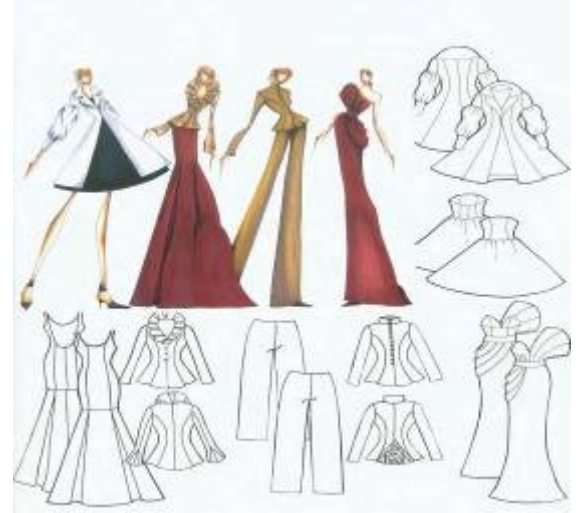
Fig. 8. Flats presentation page