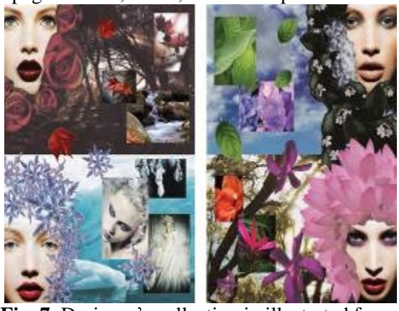
Fig. 7. Designer's collection in illustrated form.