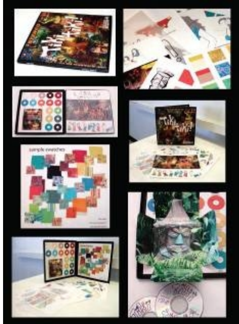
Fig. 4. Two-page spread of a designer mood board.