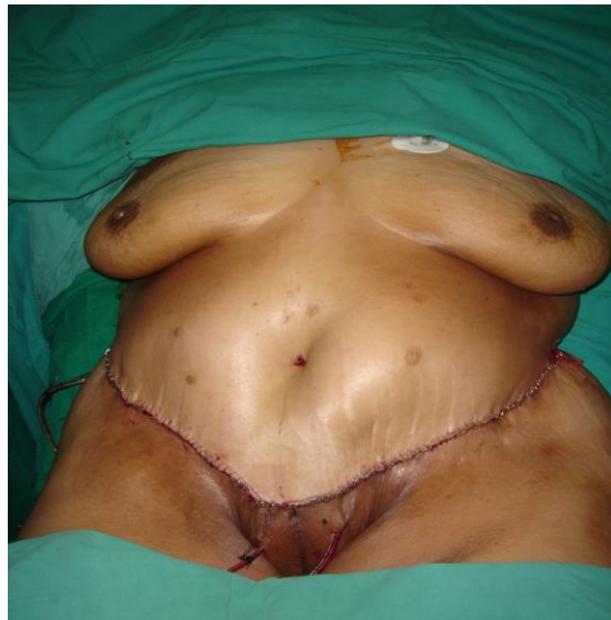
Figure (2): closing of the wound with skin stables with subcutaneous suction drains