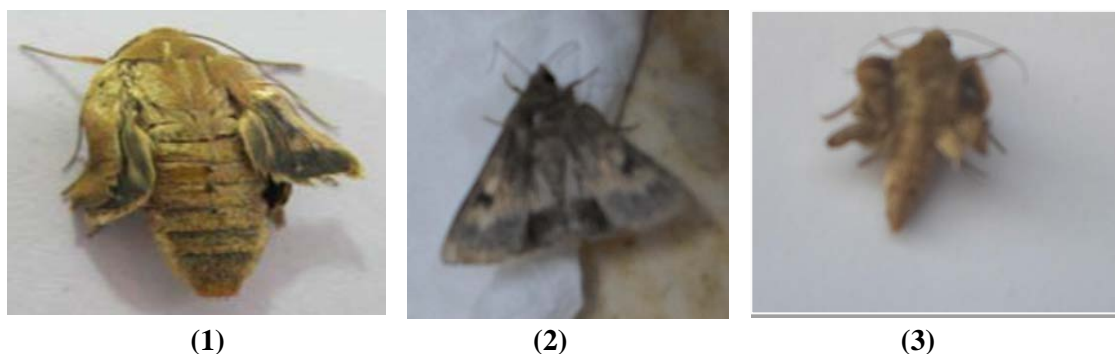
Fig. 4. Deformations of adult stage [(1 and 3 deformed adults), (2 normal adult)]

[(1, 3, 4, 6 and 7 deformed pupae), (2 and 5 normal pupae)]