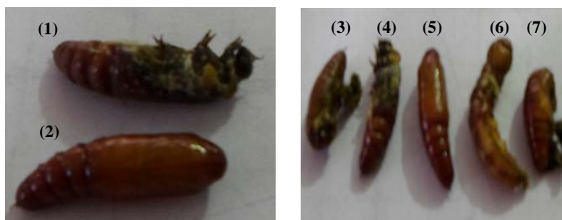
Fig. 3. Deformation of pupal stage

[(1, 3, 4, 6 and 7 deformed pupae), (2 and 5 normal pupae)]