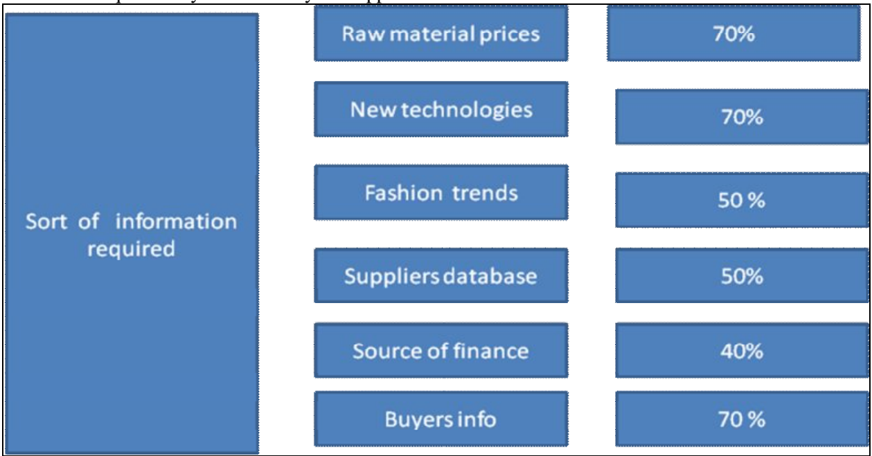
Figure 5: Required Capacity building services, focus Information

enterprises, such as raw material prices (70%), New machines' technologies (70%), Fashion trends (50%), Suppliers database (50%), source of finance (40%), and buyers information (70%).the availability of these information services would enhance the competitiveness of garment companies in international Market (please see Fig.5)