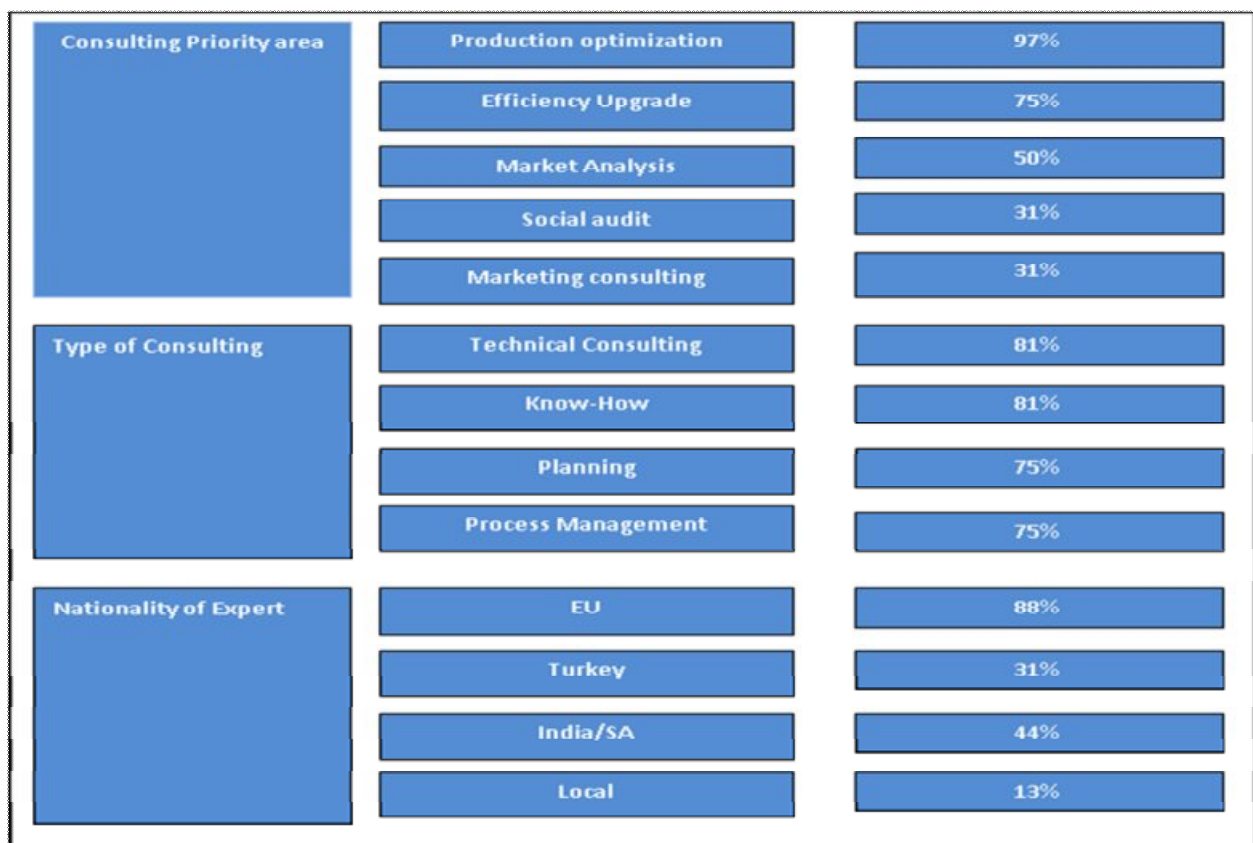
Figure 1: Results Analysis of the required consulting Services

The types of consulting services required by the garment companies surveyed ranged between technical services (81%), know-how (81%), planning (75%), and process improvement (75%).