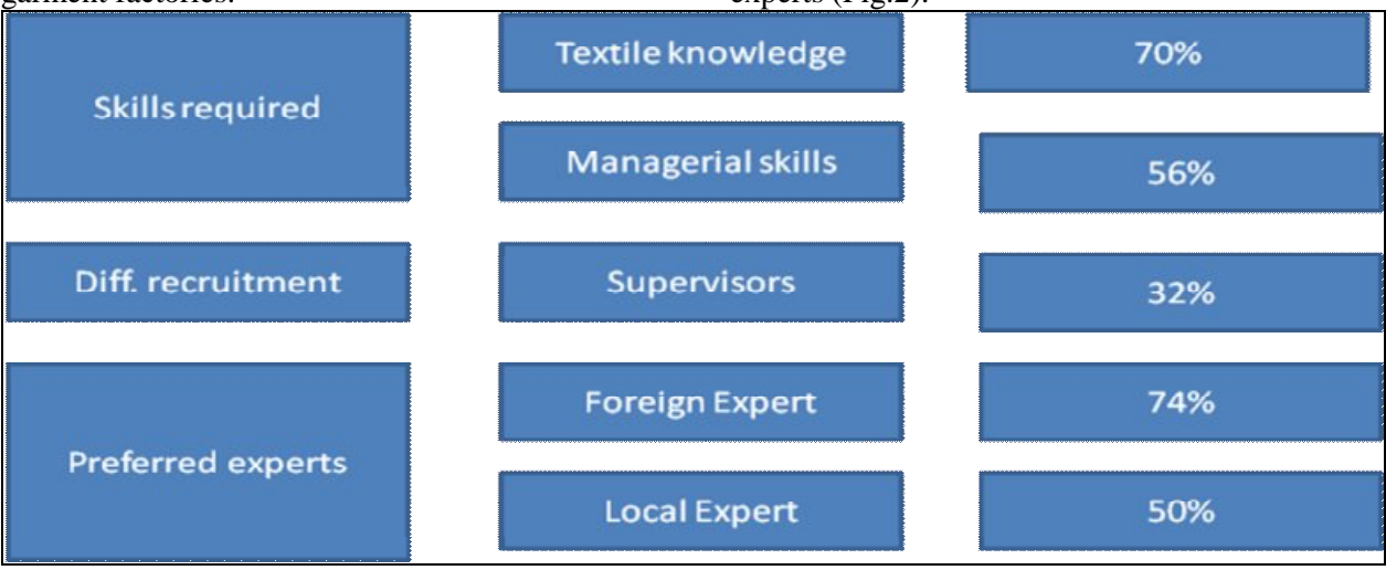
Figure 2: Required Capacity development services, focus Training

When the companies have been asked about their preference regarding the trainers' nationality, 74% of the sample have preferred to execute any potential training by Foreign Expert, however 50% have no objection to receive the training by local experts (Fig.2).