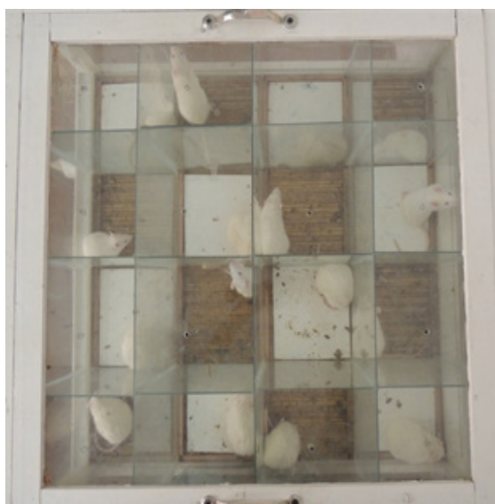
Figure 1: Communication box.

Psychological stress was induced by a communication box (CB) (Figure 1) which was proved to induce a psychological stress in rats and lead to biochemical changes in orofacial muscles and brux like activity in rats [20,21] . CB is a glass box divided into 16 compartments which separated by transparent glass partitions to allow the rats to see each other without direct contact. Small holes were perforated in the glass partitions to allow proper ventilation. The ground of the box was constructed from a metal grid connected to electric generator to allow delivery of electric shock. Half of the cells ground were alternatively covered by wooden blocks in order to electrically isolate the ground and divide the box into electric conducting and non-electric conducting cells. When the FS group received electric shock, they screamed and jumped which subsequently induced indirect stress insult to the PS group by allowing them to visualize hear and smell the reaction of shocked rats. Electric shock was delivered via a generator with output voltage 48 V that produced intermittent electric shock every 2 sec for one hour daily for a period of one month.