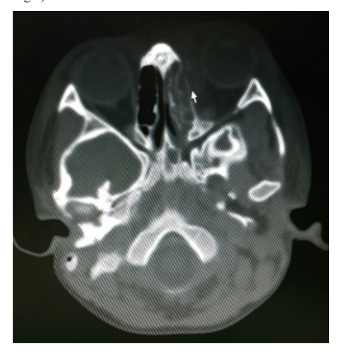
Fig. 1: Computer tomography showing left lamina papyracea subperiosteal abscess (associated with erosion of left lamina papyracea) extending into medial extraconal space of the left orbit causing mild lateral displacement of medial rectus muscle with borderline proptosis of left orbit.

medial rectus muscle and mild proptosis with bilateral preseptal cellulitis (Left more than right). There was erosion of left lamina papyracea along with both anterior ethmoidal sinuses and maxillary sinuses showed extensive mucosal thickening and suggestive of sinusitis. (Fig 1 and Fig 2)