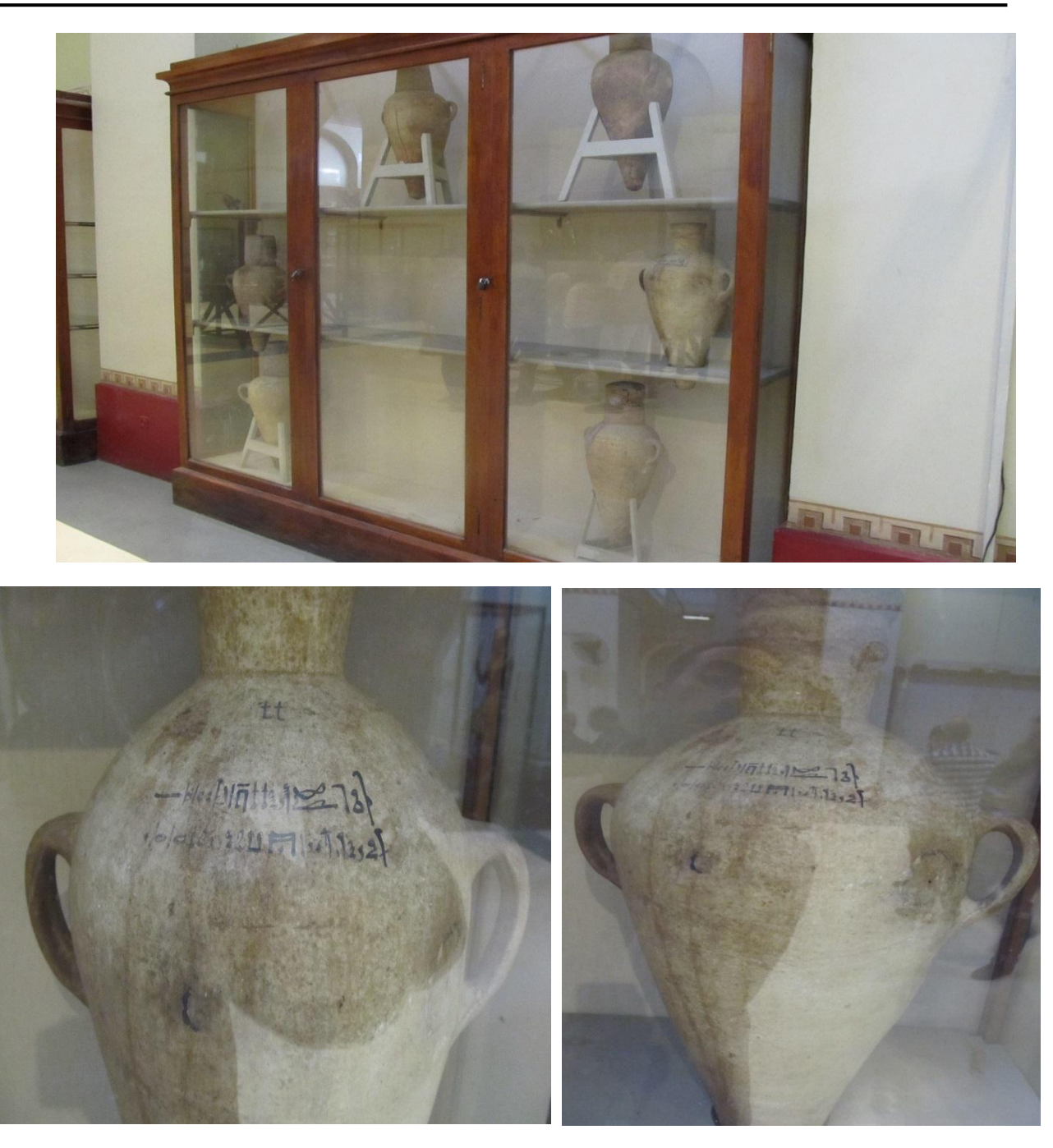
Plate II : Vessels from the collection of Tutankhamun at the Egyptian Museum showing an example of the so-called 'jar dockets.'