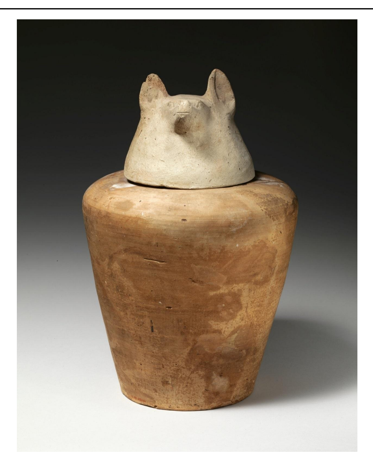
Plate IV : A pottery canopic jar with a marl jackal-headed lid representing Duamutef, protector of the deceased stomach. Found in the Theban tomb of Tetinakht.