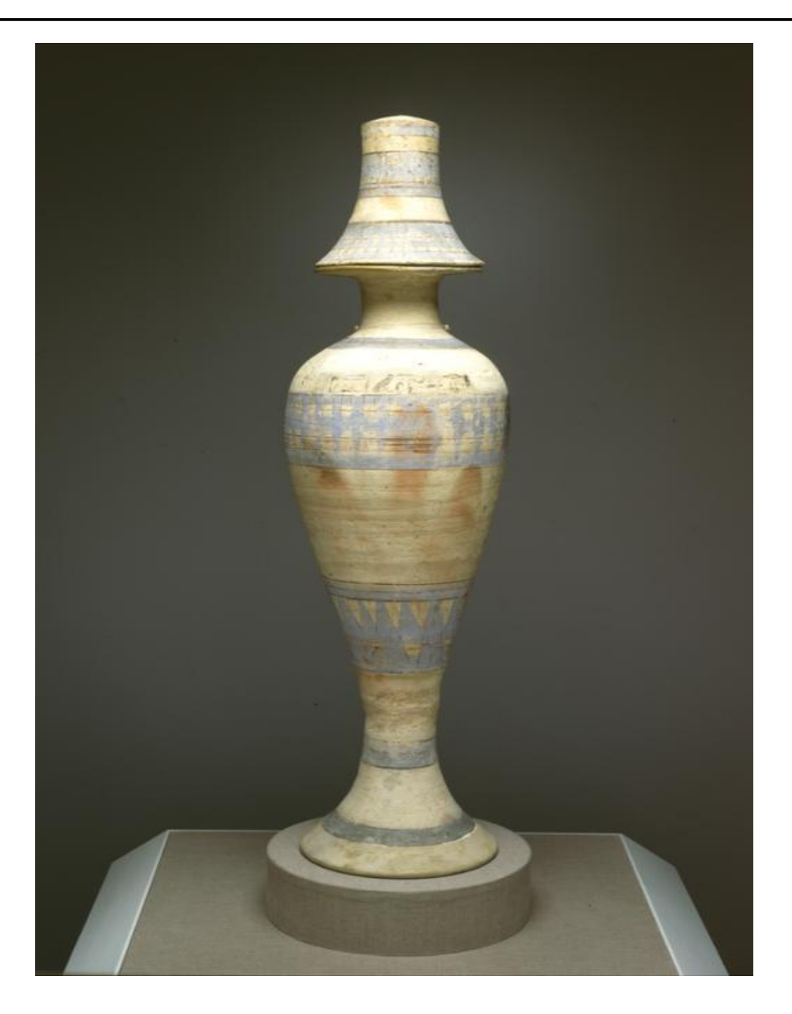
Plate III: A hs -type pottery jar with lid, inscribed and painted with bluecoloured decorations.