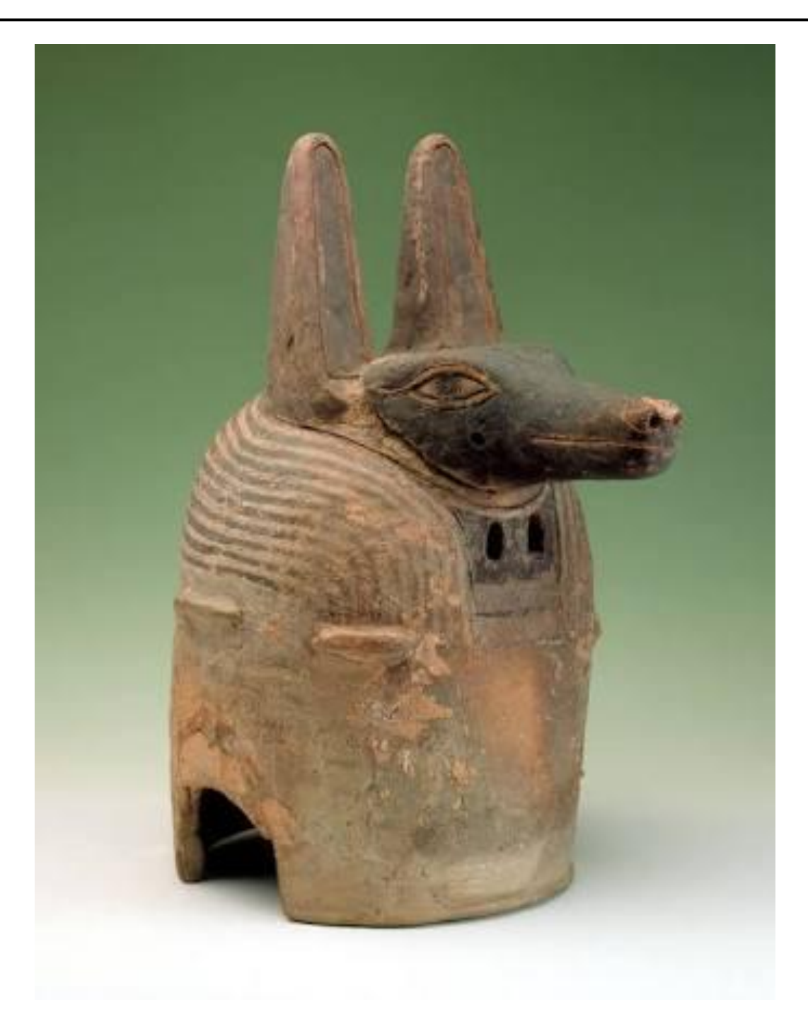
Plate VI : Pottery mask in the form of the head of Anubis, the guardian of the necropolis, which is thought to be probably worn by priests during funerary rituals.

Dynasties 21 – 24, Hildesheim, Roemer- Pelizaeus Museum