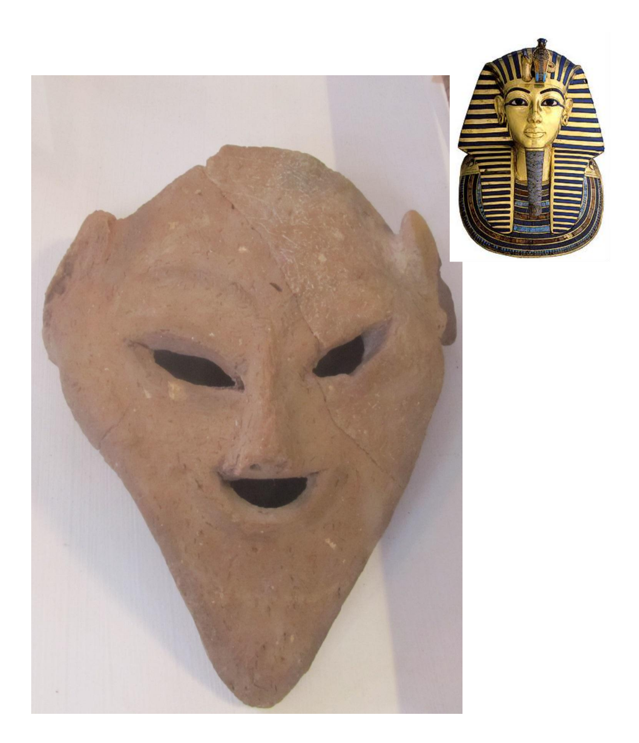
Plate V : A pottery mask, perhaps a prototype of the later funerary masks found on mummies such as that of Tutankhamun (pictured in the upper right corner).