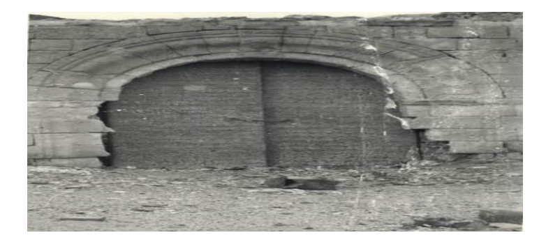
Fig. 4. Remains of the military school in Aswan