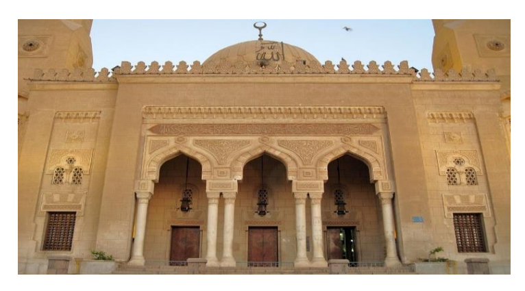
Fig. 6. Entrance of the mosque

columns inside the mosque are 24 ones distributed in architectural symmetry, decorated with stucco plaster motifs, with a distinctive huge dome in the center of the prayer hall (Fig. 7). The Miḥrab in the qibla wall is made of marble interlocking with its homogeneous colors, and next to it is the beautiful wooden dome minbar, which is full of geometrical motifs (Fig. 8). On the two sides of the mosque are two minarets written with words of the square kufic calligraphy using red brick blocks in different positions.<sup>33</sup>