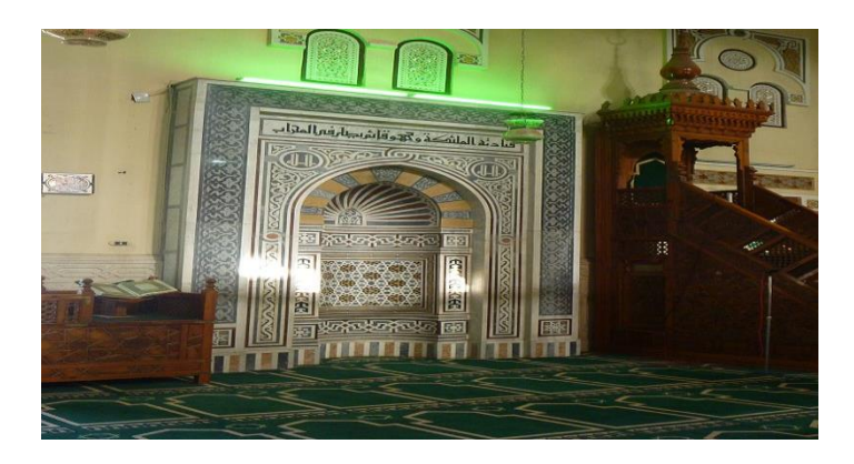
Fig. 8. Miḥrab and Minbar of the mosque