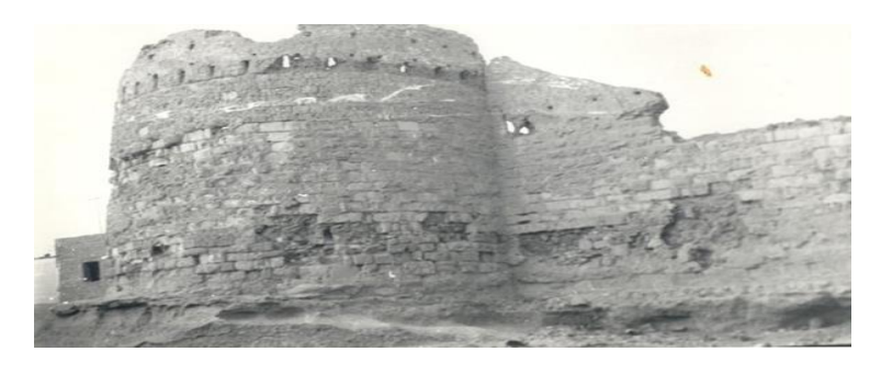
Fig. 3. Remains of the Military School in Aswan