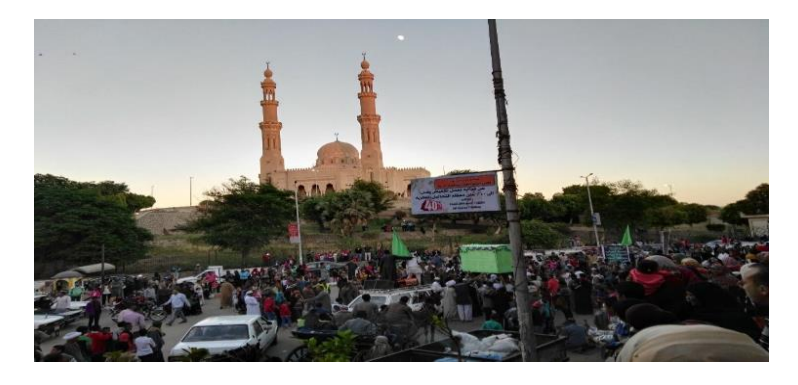
Fig. 9. Celebrations of the Birthday of the Prophet 2017 at the Foot of the Mosque

This area is one of the highest in Aswan, which makes the mosque visible from different sites in the city. The mosque is not considered as a monument, but it has a historical value due to the history of the site in addition to its high location in the center of the city. Most of the religious festivals and occasions are celebrated in the foot of the mosque (Fig. 6). It is now connected with the heritage of the city. On one side, the name is connected with the tabia of Muhammad 'Ali reminding with the original buildings and on the other side the place is connected with the religious festival ex: the night of the first day of Ramadan and the Birthday of the Prophet. Tourist programs include the visit of the mosque as an optional during the city tour.