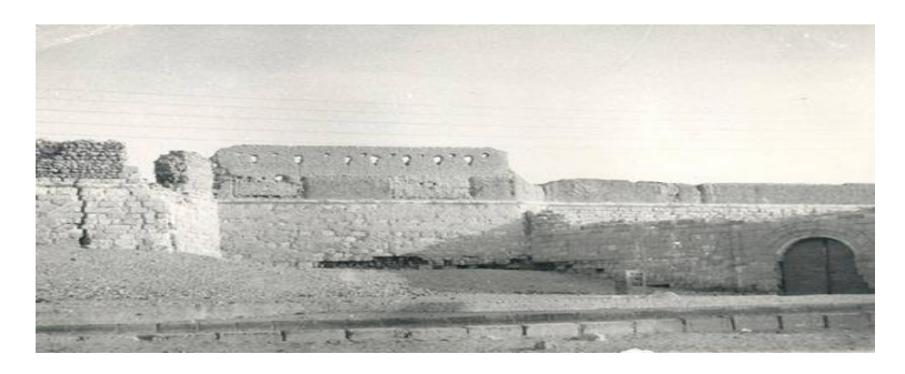
Fig. 2. Remains of the Military School in Aswan

According to Dr. Ragih, the head of the documents center in the Nubian Museum in Aswan, the buildings of the school were photographed by the UNESCO in 1959.<sup>30</sup> They are very rare photos (Fig. 2, 3, 4), because the school now is demolished, and a new mosque was built on its site. These photos were not published by the UNSCO. Even the Courier focused only on the rescue operation of the Nubian temples and did not write about the fortifications and school of Muḥammad 'Ali.