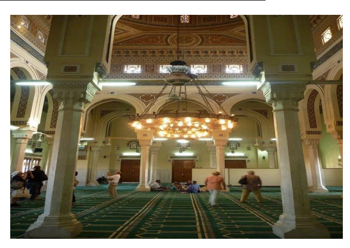
Fig. 7. Interior columns of the mosque