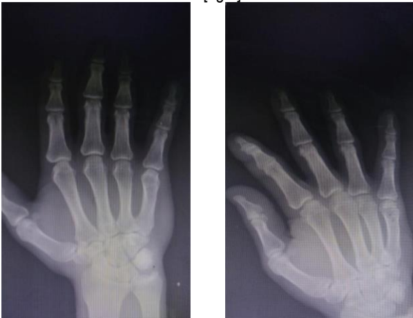
Figure [6]: Follow-up x-ray after 3 months AP view [left] and oblique view [right]