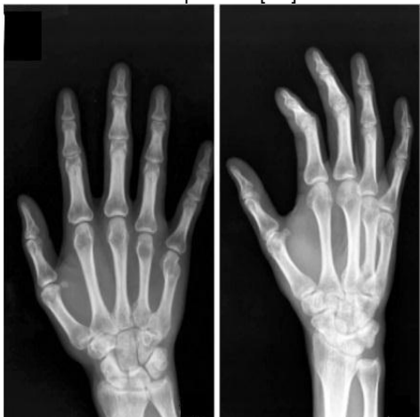
Figure [10]: Follow-up x-ray after 3 months AP view [left] and oblique view [right]