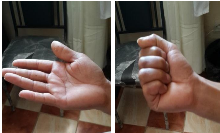
Figure[11]: Clinical follow-up after 3 months

For objective postoperative assessment, we used total active movement [TAM] score, which revealed comparable results between both techniques. Similar results were reported by Wong et al. [17] , who found that the mean TAM score was 250 for transverse group and 257 for intramedullary group in treatment of closed fractures of metacarpal of little finger. They included 59 patients and follow up was for 24 months.