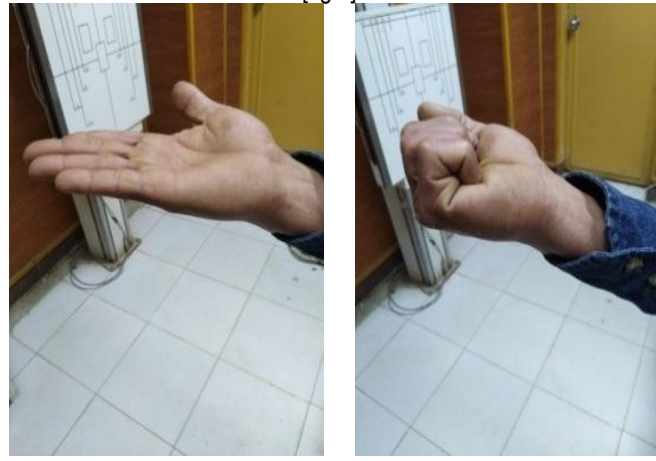
Figure [7]: Clinical follow-up after 3 months