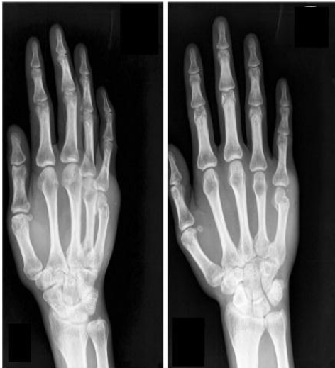
Figure [8]: Preoperative x-ray AP view [right] and oblique view [left]