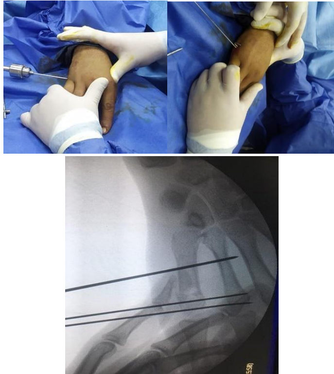
Figure [2]: Steps of transverse k-wire technique

Follow up: After either of the two techniques, a plaster splint had been applied postoperatively with the wrist in functional position including the wrist and fingers. It consisted of dorsiflexion of the wrist between 20 and 35 degree and flexion of the metacarpophalangeal [MCP] and proximal interphalangeal [PIP] joints between 45 and 60 degrees for 3 or 4 weeks. The hand had been kept elevated until edema resolved. An x ray had been carried out immediately postoperative, and serial x rays had been done every 3 weeks to assess degree of union. Active motion of the entire hand had been encouraged as soon as the postoperative splint had been removed after 3 to 4 weeks. After that, the use of the injured hand in activities of daily living had been encouraged within the limits of pain. Heavy work had been avoided until progress towards union became sufficient by radiological evaluation.