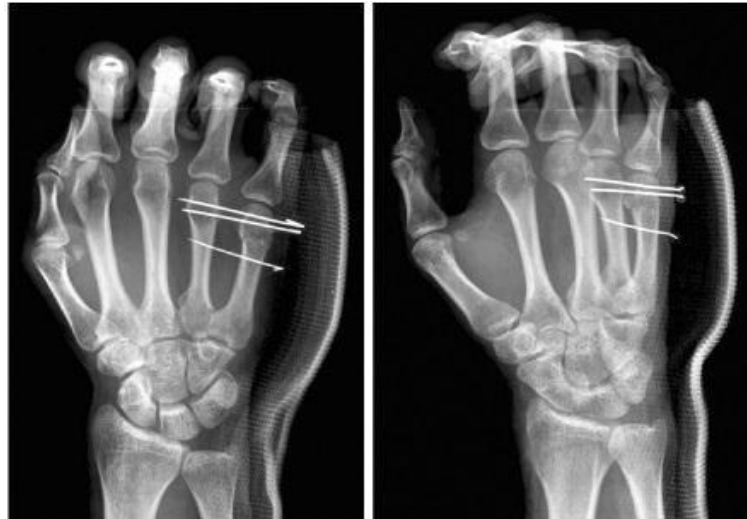
Figure [9]: Postoperative x-ray AP view [left] and oblique view [right]