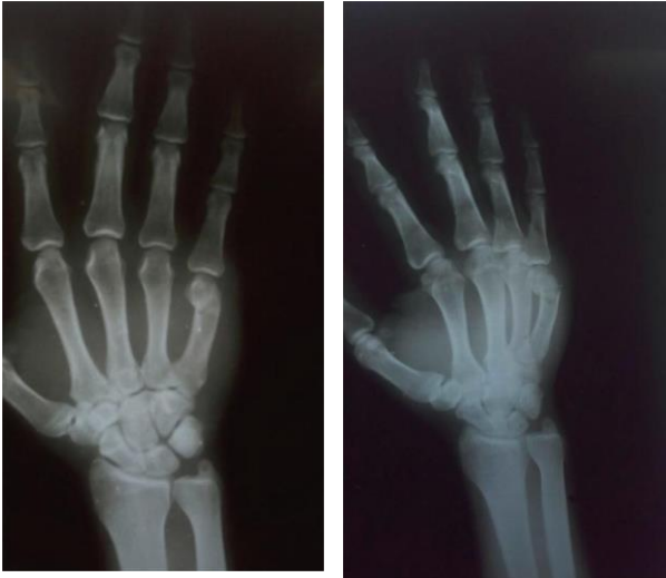
Figure [4]: Preoperative x-ray AP view [left] and oblique view [right]