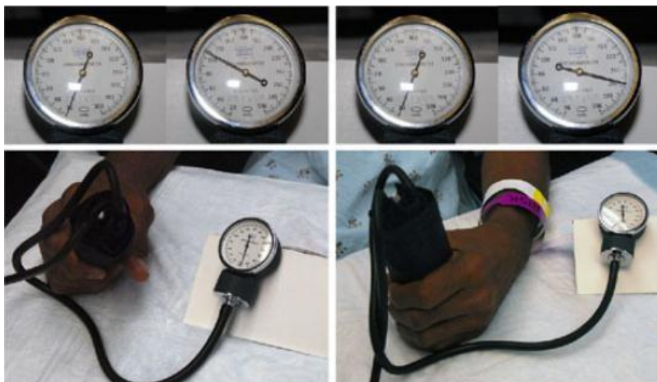
Figure [3]: Hand grip strength measuring

Data analysis: The collected data were fed to an excel sheet, coded and analyzed by statistical package for social science [SPSS], version 20 [IBM corporation, USA, Chicago]. Data were presented as mean \pm SD if they were numerical and as number [frequency] and percentage if they were categorical. Groups were compared by appropriate statistical tests [Independent samples student [t] test, Chi square, and Mann-Whitney [U] tests according to type of data]. The accepted error was set at 0.05, and considered as the cutoff for significance.