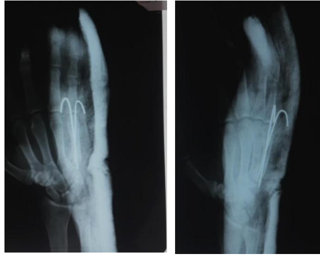
Figure [5]: Postoperative x-ray AP view [left] and oblique view [right]