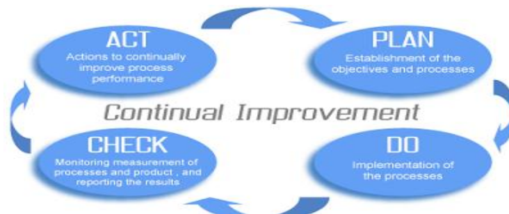
Fig. 3 PDCA Cycle

It is obvious that Standards set by management should be reviewed in a constant way. There should be continuous collecting and analyzing data on defects, and encouraging teams to conduct problem-solving activities. In this case, the standards will be in a proper form, and if deviations occur, the individuals realize that there is a problem. Then employees will review the standards and either correct the deviation or advise management on changing and improving the standard. Accordingly, Imai developed the PDCA cycle (plan-do-check-act), known as Deming cycle to be used and employed in kaizen philosophy. It is a never-ending process and is a basis for continuous improvement, as depicted in figure (2) .