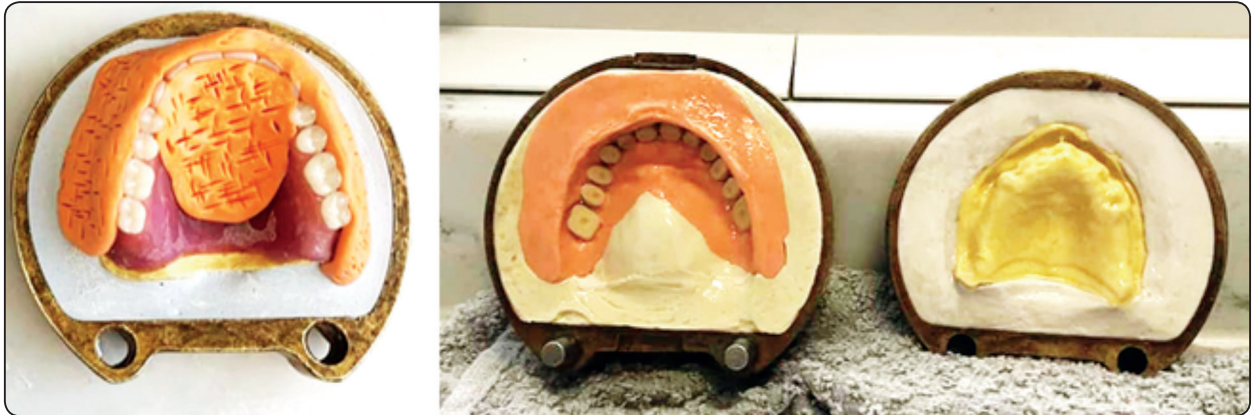
Fig. (1): Silicon Mask Flasking Technique

To mimic the process of smoking in-vivo, the smoke chamber was connected to a vacuum system, which was adjusted to maintain a steady flow rate of smoke. For active filling of cigarette smoke in smoke chamber, outlet was closed and vacuum system was switched on for 2 seconds, so as to mimic active inhalation of smoke in-vivo (puff duration). To maintain passive exhaust of smoke, the outlet was left open for 60 seconds before the next smoke cycle will be performed, so as to mimic passive exhalation of smoke in-vivo.