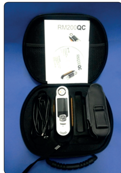
Fig. (2): Spectrophotometer

background was selected and measurements were made according to the CIE L^*a^*b^* color space relative to the CIE standard illuminant D65 where; L^* = lightness (0-100), a^* = (change the color of the axis red/green) and b^* = (color variation axis yellow/blue), as showed in figure (2).