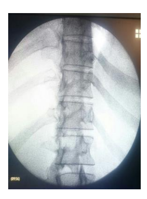
Fig (1) in oblique view showing end on appearance of needles at level of T10