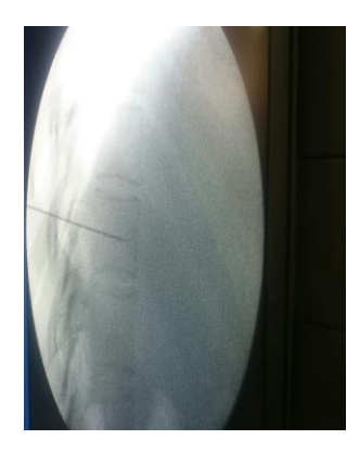
Fig (2) in lateral view showing needle tip at junction of anterior 1\3 and posterior 2\3 at T10