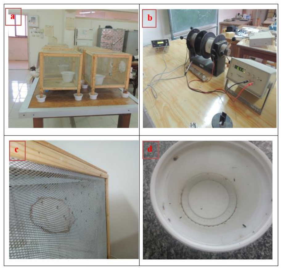
Fig. 1: Experimental aspects of the effect of the magnetic field on mosquito immature stages. Mosquito rearing (a), SMF exposing facility (b), blood-feeding (c), and hatchability (d).

exposed egg rafts were counted daily until no further egg hatch was observed. Three replicates were performed for each group.