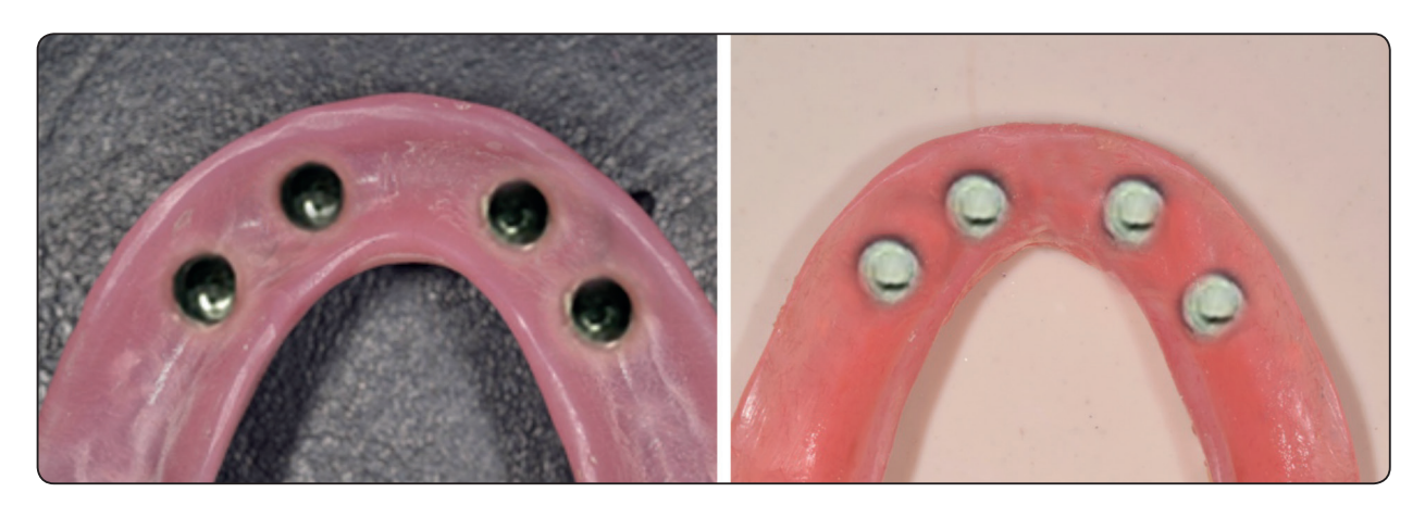
Fig. (2) Fitting surface of the overdentures with secondary copings a; Cobalt chromium metallic secondary copings (group I), b, PEEK secondary copings (group II)