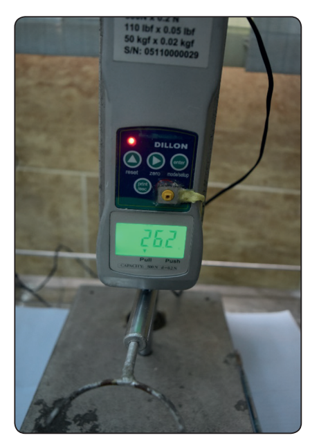
Fig. (3) Retention measuring device

Force meter device was used to measure the retention of the mandibular overdenture in Newton (fig 3). Measurement of retention was recorded in vertical direction perpendicular to the patient's occlusal plan using a special device for measurement of clinical retention values of overdentures previously described by Refaat and Elsyad<sup>34</sup>. For all overdentures, four hooks were attached to the buccal flange at the canine and first molar areas using autopolymerized acrylic resin at the same height. The mandibular overdenture was completely seated in the patient's mouth. Force gauge was attached to the measurement device perpendicularly to ensure movement with the device as one unit in a vertical direction. The patient was asked to sit keeping the mandibular occlusal plane parallel to the floor. The hooks would engage intraorally to the fork of the force meter at the pull end. The wheel in the stand of the device was used to move the force gauge in vertical direction which is absolutely perpendicular to the base of the device and to the patient's mandibular occlusal plane. The force gauge was used to measure the pull force (in N) needed to dislodge the mandibular overdenture from its place. Measurement of retention forces were made immediately after overdenture insertion, 3 months and 6 months after insertion by independent dental personnel blinded to treatment groups.