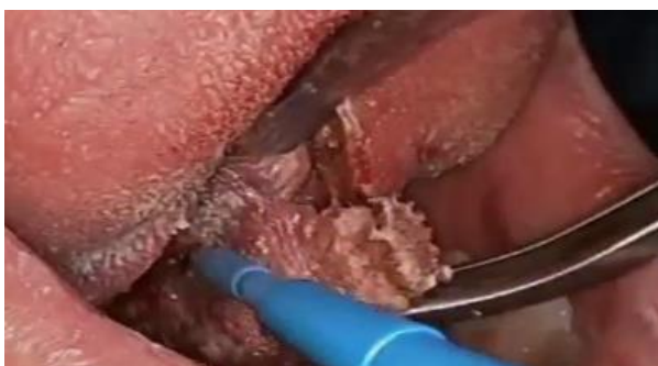
Figure (3): Excision of middle portion of the tongue base using Bovie coagulation electrocautery.