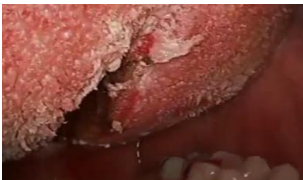
Figure (4): Gap after removal of middle portion of tongue base closed by absorbable suture

Post-operatively, all patients received oral antibiotics, analgesics, and anti-edematous drugs with oral soft diet for 7 days, with routine follow up to monitor surgical healing and manage any complications. After 6 months overnight polysomnography and Muller maneuver had been repeated.