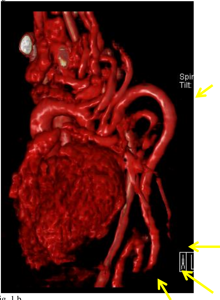
Fig. 1 b