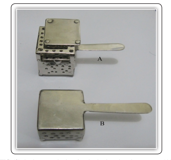
FIG (2) A photograph showing both closed and open tray (A) open tray, (B) closed tray

Load applicator device equals 6.5kg corresponding to finger pressure used for seating