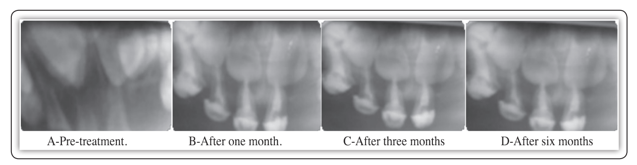
FIG (1) X-Rays of pulpectomy by mix of Zinc oxide with aloe Vera gel (group A).

Only 19 teeth (95%) of this group responded positively to mixture of zinc oxide with aloe Vera gel in pulpectomy procedure and appear normal as evaluated and measured by clinical and radiographic assessments for six successive months. while the other one teeth (5%) was respond negatively and were retreated or extracted. Radiographically, the succeeded teeth showed normal root and periapical area after pulpectomy by mix of zinc oxide with aloe Vera gel (Fig.1).