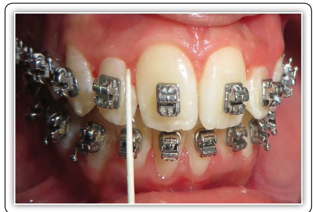
Fig. (4) Dental plaque assessment

the variance. Kolmogorov-Smirnov and Shapiro-Wilk tests have been conducted to assess the distribution of data in the three groups showing that there were no significant differences in the all data in the three groups, indicating that the data were normally distributed, therefore parametric statistical tests were performed for bacterial count.