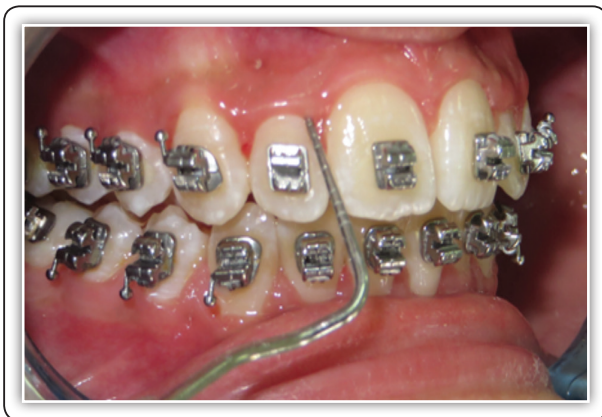
Fig. (3) Periodontal pocket depth measurement.