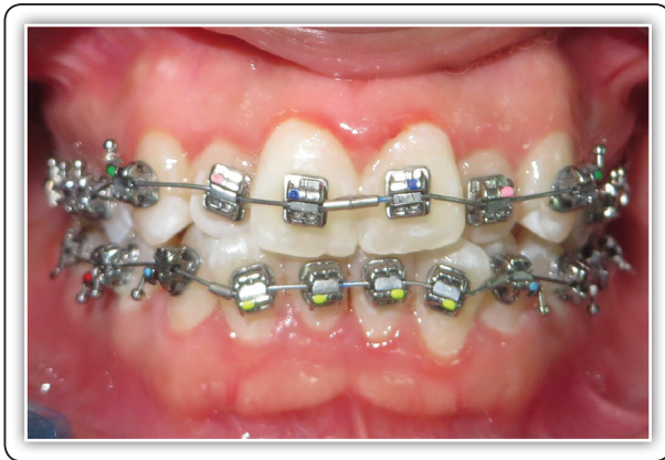
Fig. (1) Active SLBs (Prodigy)