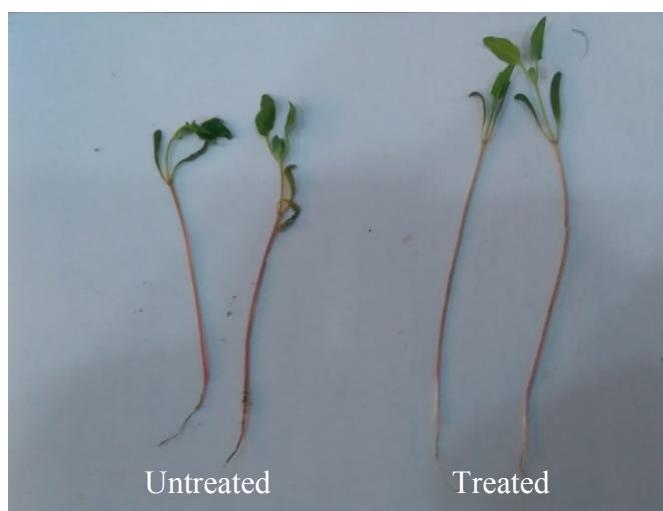
Fig. (3). Efficiency of the mixture of Streptomyces strains on root-rot suppression and growth promotion.