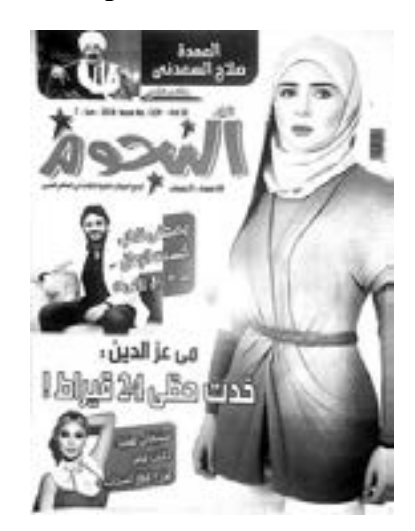
Fig.10. Example of insider stories

As seen in Table 3. women are mainly present in the insider stories. In Fig.10. published