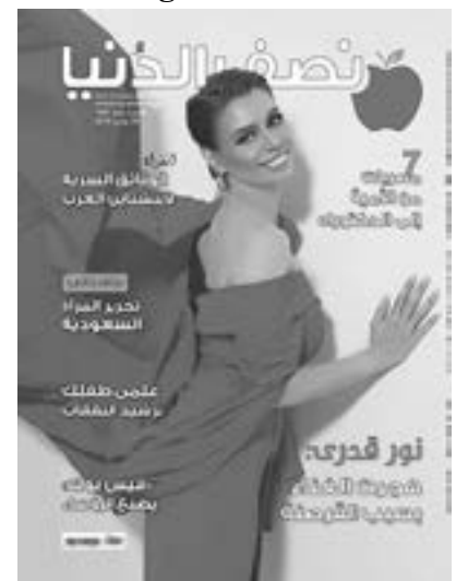
Fig.5. Example of Attractiveness on magazine covers

Opening his hands with a little and serious smile Al Sisi the Egyptian president of Egypt is depicted on the cover of Al Mussawar magazine. He wears a tie and a suit all in blue giving a serious and professional impression.