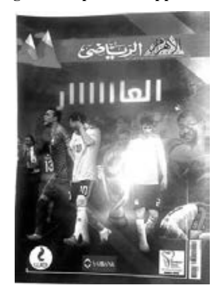
Fig.7. is a good demonstration of sadness and disappointments on magazine covers. Al Ahram Al riyadi covers the loss of the national team in the World Cup. The designer of the cover chose to write the word Shame and to repeat the letter several times to show how severe and bad the situation is. Gestures of sadness and disappointments are seen on a red background on the cover while the goalkeeper and the players, as well as the audiences, are crying and screaming. (Cover page, Al Ahram Alriyadi, 2018)

1.5. What are the postures of the depicted?