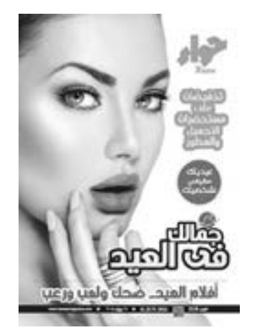
Fig.8. Example for full face

As seen in the cover of Hawaa about the beauty of women in Eid a close up on a face with colorful makeup helps to explain the idea of the text. (Cover Page, Hawaa, 2018)