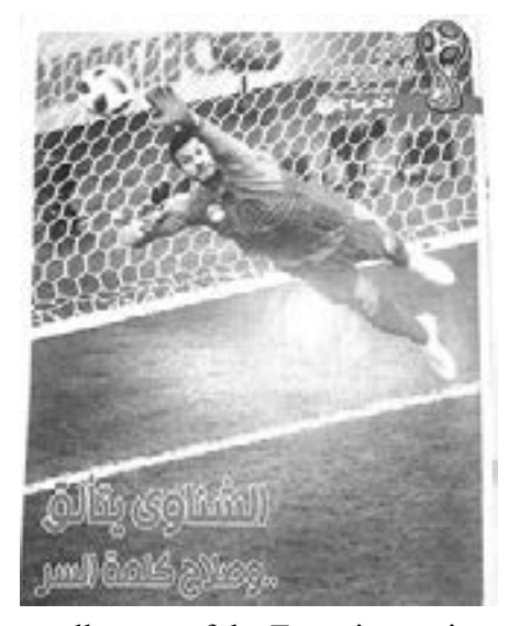
Fig.15. Example of positive description for men

"The goalkeeper of the Egyptian national team El Shenawy shines ... and the star Mohamed Salah is the secret word" This is the cover page of Akher Saa that shows the positive connotations given to two football player describing them as successful and brilliant (Fig.15). (Cover page, 2018)