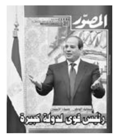
Fig.4. Example for serouisity on magazine covers

Opening his hands with a little and serious smile Al Sisi the Egyptian president of Egypt is depicted on the cover of Al Mussawar magazine. He wears a tie and a suit all in blue giving a serious and professional impression.