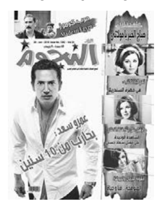
Fig.6. Example for Anger

As seen in Fig.6. the Egyptian actor Amro Saad is depicted with an angry gesture that goes along with the textual caption that is accompanying the visual. The actor looks angrily at the reader in a half body image leaning to the front as if he threatens the reader or is in the middle of a fight. The quote taken from the actor is that he has fought for 10 years (to arrive at the point where he stands nowadays.) (Cover page, Alnogoum, 2018)