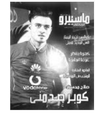
Fig.13. Example for the Conflict Frame