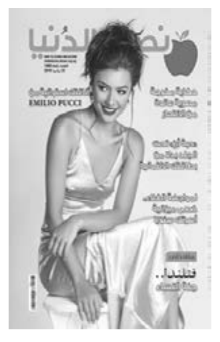
Fig.2. Example for youth on magazine covers

Most of the analyzed magazine covers depict women and men who are middle-aged. In Fig.2. Nisf Al Dunia depicts a middle-aged woman on the cover page that talks about exotic fashion trends for women. (Cover page, Nisf Aldunya, 2018)