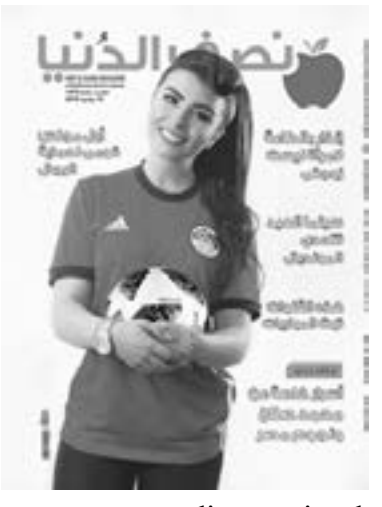
Fig.9. Example for torso

On the contrary, some distance is taken to this image that is taken until the hips or torso to