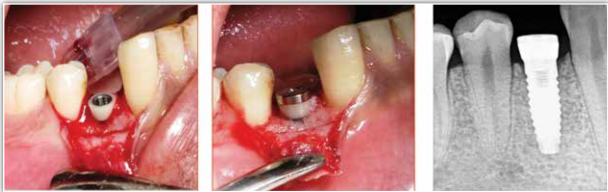
Fig (1): Zirconium collar implant