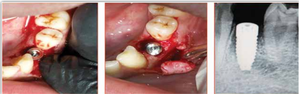
Fig. (3) : Titanium collar implant