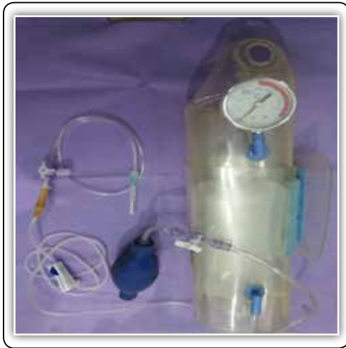
FIG (1) C-fuser containing lactated Ringer connected to three ways cannula by I.V. infusion set.

Lactated Ringer solution was placed in the cuff of the C-fuser, and the cuff was properly closed. The solution was connected to a three way cannula by I.V. infusion set which was connected to the posterior needle inserted in the 10-2 point marked previously on the patient. First pressing on the squeeze bulb of the c-fuser was performed to elevate the pressure. At low pressure (150 mmHg) the outflow of the fluid through the second needle started slowly drop by drop as for lavage the joint with 250 ml for 5 minutes. On the other hand, at high pressure (400 mmHg) outlet of the fluid was continuous and rapid for lavage of the joint with 250 ml for 3 minutes. Then the air release valve of the c-fuser was closed to fix the pressure. After that the three-way valve was opened to allow the flow of the fluid through the posterior needle. After lavage, the I.V. infusion set valve was closed, the outlet needle was removed, and 2ml. of Hyalgan was injected in the joint cavity. After injection the inflow needle was removed.