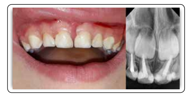
FIG (2) Post-operative image and x-ray

The treated teeth were sealed as done previously, in the later appointments followed by composite resin as a final restoration (Figure 2).