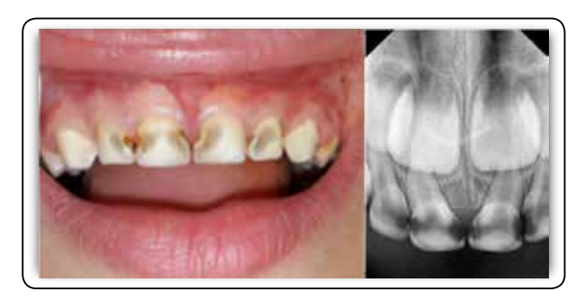
FIG (1) Preoperative intraoral image and X-ray

Chemomechanical Preparation: Sterile Universal K files were used for mechanical preparation of the canal.