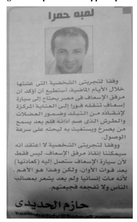
Fig.5. Example Column applied punning

to wash off all the dirt their regime has done. Therefore they seek help from a US company to change their negative image. The target of this cartoon is the Qatari regime by drawing a huge number of chloride are unable to clean the "dirt". Satire is the technique of humor used in this cartoon. The cartoonist is clarifying how dumb the Qatari regime is. As they think that they could wash their country reputation in a washing machine, while they are even dumber to wash it by themselves that they need any assistance from the USA. (Fahmy, 06/09/2017)