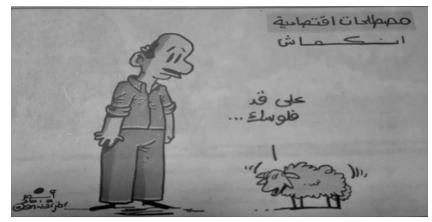
Fig.3. Example Economic Cartoon that applies Wordplay, Contradiction, and Opposition

In Fig.3. the theme in this cartoon is economic. Humor is created through the contradiction, opposition, and wordplay. The Egyptian citizen is the target of the humor and is described as not capable of buying a sheep to slaughter for a celebration due to his economic circumstances. Therefore he is obliged to buy a very thin sheep. This situation is described by the cartoonist as "contraction or recession" which is an economic term but that the cartoonist uses in a different meaning (the contraction or recession of the sheep that the man will buy for his feast). The context of this cartoon is the increasing prices of sheep and cows before the feast.(Unknown, 07/09/2017)