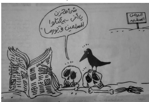
Fig.4. Example Cartoon applied Punning, Association, and Association

Skeletons are reading newspapers while buried in the sand in the "Happy Yemen" and say "It is very sad bro. The killing of Muslims in Burma." Association (Fig.4.) is used in this cartoon: the end result of combining elements together to create the cartoon through linking, combining, comparing elements together. Transposition is applied because skeletons in Yemen are feeling sad about what is happening in Burma and are sad about what happened to them. The punning is seen while these are skeletons and dead people they live in happy Yemen and them -although dead- are sad about the situation of the Muslims in Burma. Their situation themselves is not better.(Unknown,07/09/2017)