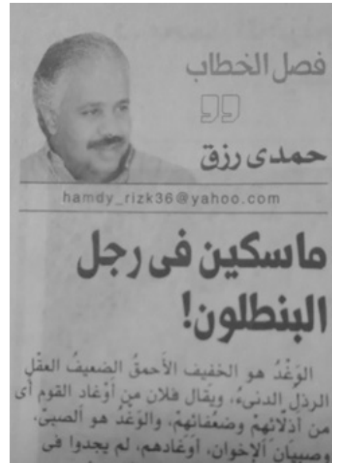
Fig.1. Example of a political column that applies contradiction, exaggeration, punning and satire

The Results of this paper revealed the use of different humor techniques that cartoonists used as well as a wide range of themes and targets. I will present here some Examples of columns and cartoons in order to explain the different uses of the humor techniques. In the explanations, lots of details are revealed about the categories of analysis mentioned in the Methodological Part of this paper.