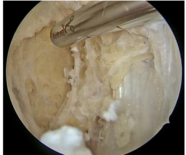
Fig 1: Debridement the most proximal Hoffa fat pad.

Arthroscopic debridement of the adipose tissue of the Hoffa’s body posterior to the dorsal surface of the patellar tendon, debridement of the abnormal portion of the deep surface of the proximal patellar tendon, and arthroscopic excision of the lower pole of the patella if needed (presence of a prominent bony spur in preoperative radiology). (Figs 1,2)