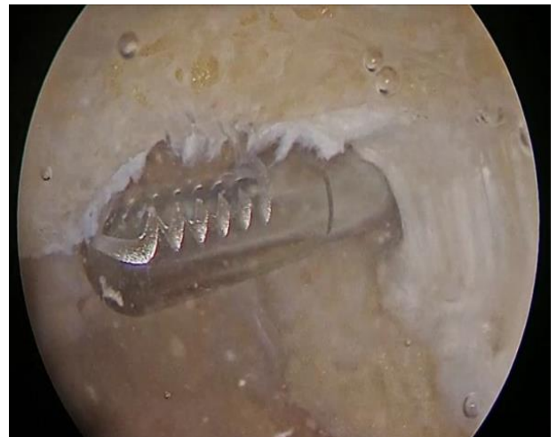
Fig 2: Arthroscopic appearance of the inferior patellar pole after abrasion

All patients were allowed for partial weight bearing with crutches from day one. The patients were instructed to start full non-weight bearing range of motion exercises. After one week walking and light bicycling activity were initiated. Light concentric and eccentric strength training for the quadriceps muscles was instituted.