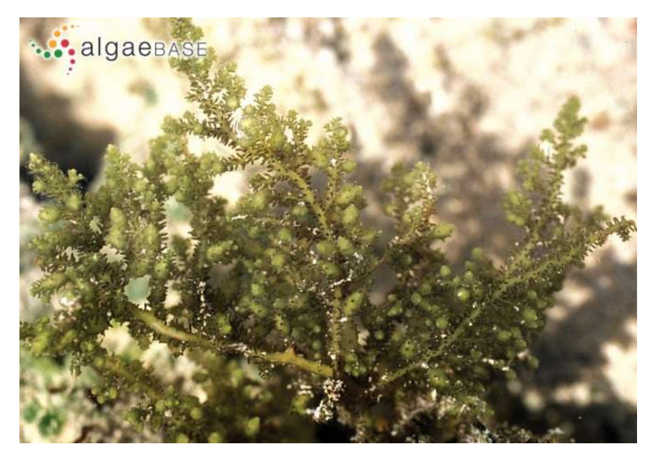
Fig. (1): Cystoseira myrica (S.G.Gmelin) C.Agardh (download from http://www.algaebase.org/search/species/detail/?species_id=11399)

The results of histological grading scale on day 18 post-wounding were shown in Table 1. Histological evaluation of the wound region revealed that inflammatory cell infiltration score was significantly lower in Group B (P < 0.05). Angiogenesis score was significantly lower in group B (P < 0.05). ECM deposit was significantly higher in Group B (P < 0.01). The percentage of epithelialization was significantly higher in Group B (P < 0.05).