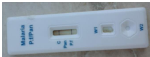
Figure (1): P. falciparum +ve RDT

Parasitological Examination: Thin and thick blood films were prepared and stained by 10% Giemsa-stain 12 , then examined microscopically by experts. Immunological method: RDT interpretation: C band development indicates test validity. In case of presence of C band only indicate –ve result. The presence of pf band (with C band) indicates +ve result for P. falciparum (Fig.1).