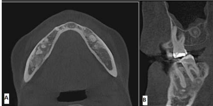
Fig. (4): A, is an axial CBCT slice at level apically to the root apex which show the sclerotic borders around the lesion. B, Sagittal CBCT slice showed the maxillary lesion and sclerotic border of the lesion on the mandibular right side.