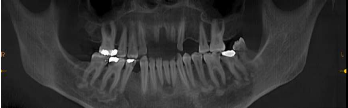
Fig. (1): CBCT reformatted panoramic image showing multiple well-defined radiopaque masses with radiolucent boundaries and has apparent sclerotic border. The lesions bilaterally related to the apices of premolar/ molar region in the mandible and one lesion at the 2nd maxillary right molar area.

aware of the condition to maintain unnecessary treatments that could result in infection of affected areas [16].