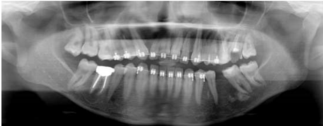
Fig. (5): Panoramic radiograph showed well-defined periapical multiple radio- opaque masses related to mandibular left second molar with encapsulated border. In addition, there is small radio-opaque foci located inter- dental between mandibular left premolars.