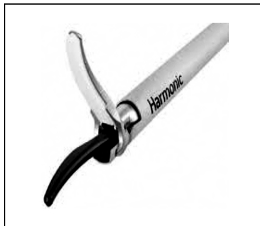
Fig. (5): Harmonic used for sealing and dissection of structures during operation.