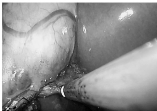
Fig. (4): Coagulation and cutting of cystic duct.