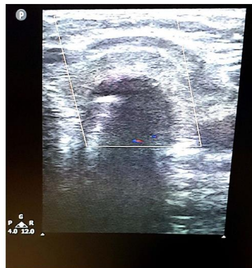
Fig. (1): Doppler US at the level of 2 nd tracheal ring for preoperative scanning of vascular structures.

Doppler signals over the trachea were activated on the level of the second ring. Aiming to reduce the possibility of non visualization of veins, patients could be temporarily positioned in a head down position to improve venous filling in the scanned area. Care was taken during scanning to keep only minimum pressure with the ultrasound probe to avoid collapse of vessels by the probe pressure. When round, well demarcated structures, suspicious of being vascular in nature were identified anterior to the trachea, numerous maneuvers were useful to examine whether the structures seen were artery or vein. 1 st , compression was applied with the probe to inspect for luminal reduction as a response to variable grades of compression. 2 nd , a Doppler cursor was located over the structure to be tested and Doppler flow was displayed by sound or graph to screen for signal of pulsatile flow of arteries. 3 rd , a square region of interest was placed around the structure and color Doppler analysis was performed ( Figure.1 ).