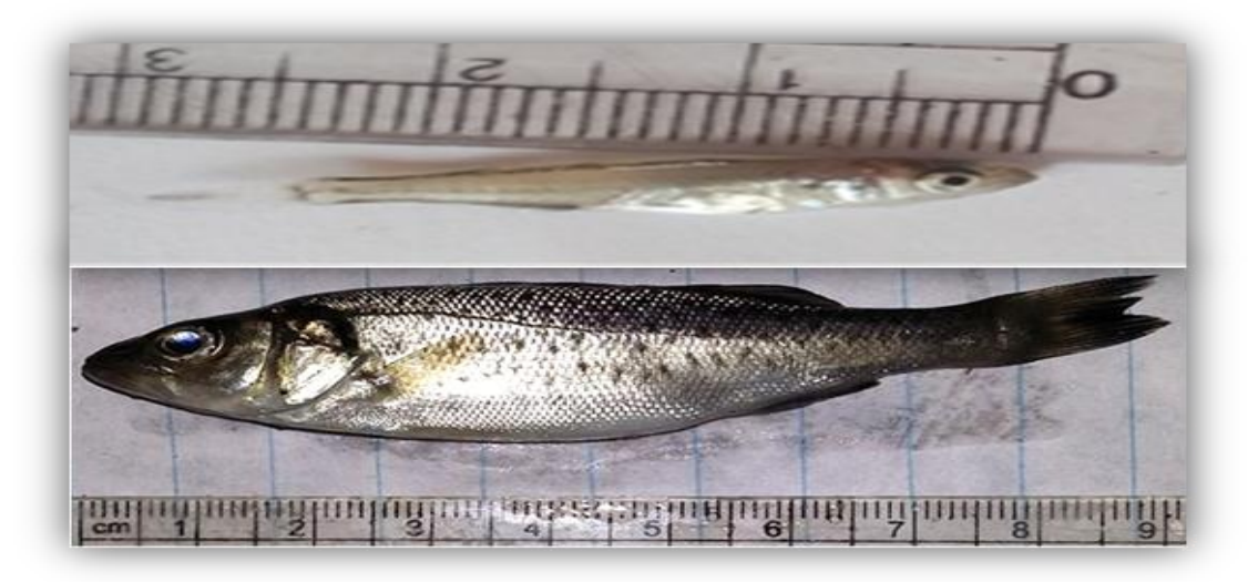
Figure1: Photographs of fingerling (above) and small fish (below) of sea bass Table (1): Ingredients composition (%) of diets used in experiment