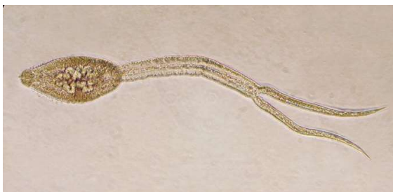
Figure 2: Cercaria released from the snails, can enter conjunctiva or the Cornea