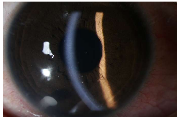
Figure 4: Single anterior chamber granuloma with granulomatous keratic precipitates

The presentation is usually unilateral. However bilateral involvement is seen in few cases. There may be more than one nodule and these nodules are usually 2-5 mm in diameter (Figure 5). They are mostly located in the retro-corneal surface in the inferior quadrant. There may be associated granulomatous Keratic precipitates and anterior chamber reaction (Figure 6). The granuloma is well circumscribed and white in colour. In case of sub conjunctival granuloma usually the lesion is in the palpebral area. Few patients can even present with granuloma in their lid mimicking a chalazia. Usually