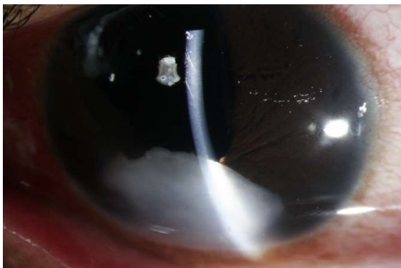
Figure 5: Two anterior chamber granulomas in same eye

vision is good except for in cases where the recurrent inflammation causes complicated cataract or retro corneal membrane (Figures 7 & 8) secondary to the large AC granuloma which reaches the visual axis. Prolonged steroid use can cause cataract and glaucoma in few patients.