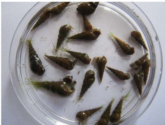
Figure 1: Snail Melanoid tuberculata, first intermediate host of Trematodes

parasite as a trematode belonging to Procerovum Varium. When these birds come in contact with water the adult worms release the eggs. The eggs hatch into miracidia, and infect the snails, which act as intermediate host. These miracidia mature to form cercariae in the intermediate host which are snails, Melanoid Tuberculata. (Figures 1 & 2) These cercariae have to reach eyes of birds. Instead they reach human eye when these children swim in the pond where these infected snails live. Humans become accidental host if infected with the cercariae. Several other species of trematode ( F. hepatica , Schistosoma sp. etc) infection has also been reported in human eye 13 . The cercariae of Schistosoma sp parasites are known to induce dermatitis in patients exposed to infested ponds or rivers. These cercariae die after they penetrate the skin; their death causes a localized inflammatory reaction.