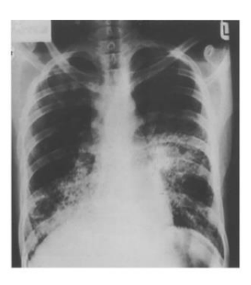
a. Middle and lower zone infiltrates (23)