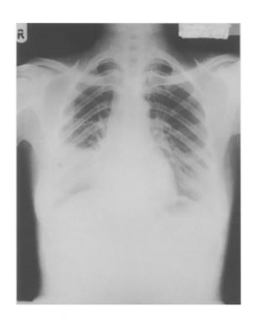
c. Bilateral Atypical tuberculous consolidation (23)