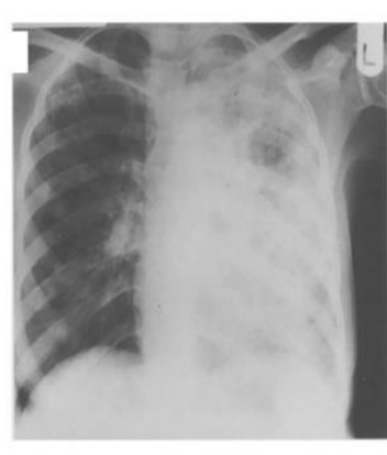
b. Left lung Consolidation and cavity (23)