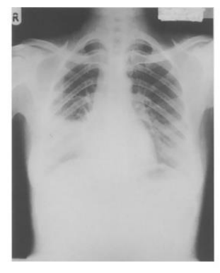
c. Bilateral Atypical tuberculous consolidation (23)