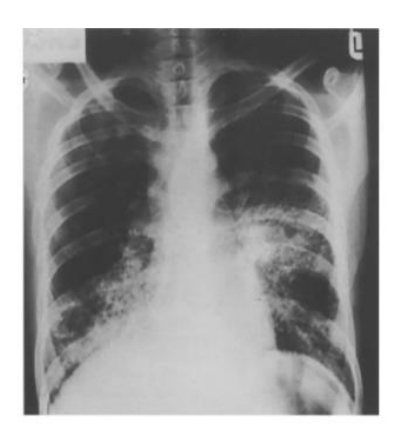
a. Middle and lower zone infiltrates (23)