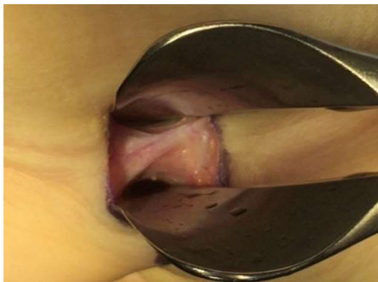
Figure [2]: Good visualization of the transverse carpal ligament between 2 blade of nasal speculum.

The operations had been carried out under general anesthesia with application of arm pneumatic tourniquet. A transverse incision about 1.5 cm had been created at the level of proximal wrist crease between flexor carpi radialis and palmaris longus tendons, followed by retraction of the palmaris tendon, and blunt dissection up to the proximal edge of transverse carpal ligament and the median nerve. The wrist had been hyperextended and the soft tissues superficial and deep to flexor retinaculum had been retracted away by using nasal speculum. This permitted good visualization of the flexor retinaculum between its blades [one blade retract the superficial structure containing the palmer cutaneous branch of median and ulnar nerve with superficial palmar arch. The other blade mainly protect and push the median nerve away from the flexor retinaculum] [Figure 2].