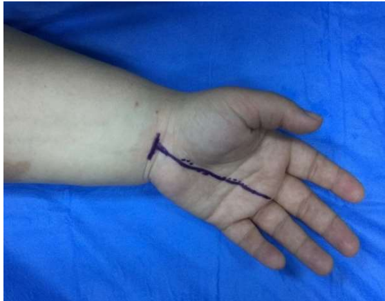
Figure [1]: surgical marking a] flexor carpi radialis b] palmaris longus c] radial border of the ring finger and d] proximal wrist crease.

carpi radialis, palmaris longus, radial border of the ring finger and proximal wrist crease [Figure 1].