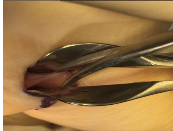
Figure [3]: Snip of the proximal edge of the transverse carpal ligament using scissor

Small snip using the blunt edge surgical scissor had been done for the flexor retinaculum [Figure 3], then the surgical Ballenger swivel knife [Figure 4] applied at the snipped retinaculum and pushed gradually to cut all the flexor retinaculum [Figure 5].