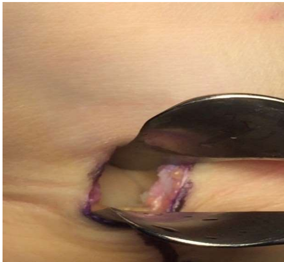
Figure [6]: Median nerve after carpal tunnel release

After CTR proper visualization of the median nerve through opened tunnel using nasal speculum, a freer dissector had been completed [Figure 6].