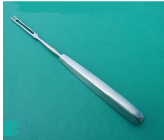
Figure [4]: Ballenger swivel knife