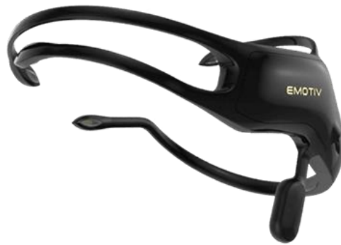
Fig.1. Emotive Insight

Interest Indicator measures the amount of what you like or dislike about something. This means the extent of your mind's interest in practicing exercises related to the sports activity practiced or not. The greater the amount of your interest during performing the exercises indicates to the correctness of the youth's selection to practice this type of sports activity. (Emotive.2019)