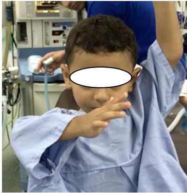
Fig. 1: Preoperative active range of motion.

Inclusion criteria: This study included patients with shoulder internal rotation contractures, limitation in passive external rotation (less than 10 degrees), younger than 6 years before uncorrectable glenoid deformities, with no history previous shoulder surgery.