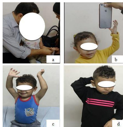
Fig. 4: a, b, c & d- postoperative ROM