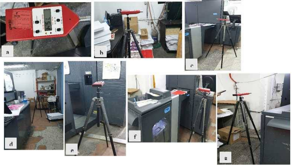
Figure (2): The experiment on site (room 1) while measuring sound levels: a) QUEST noise level instrument, b) Point 1 measurement, c) Point 2 measurement, d) Point 3 measurement, e) Point 4 measurement, f) Point 5 measurement, g) Point 6 measurement