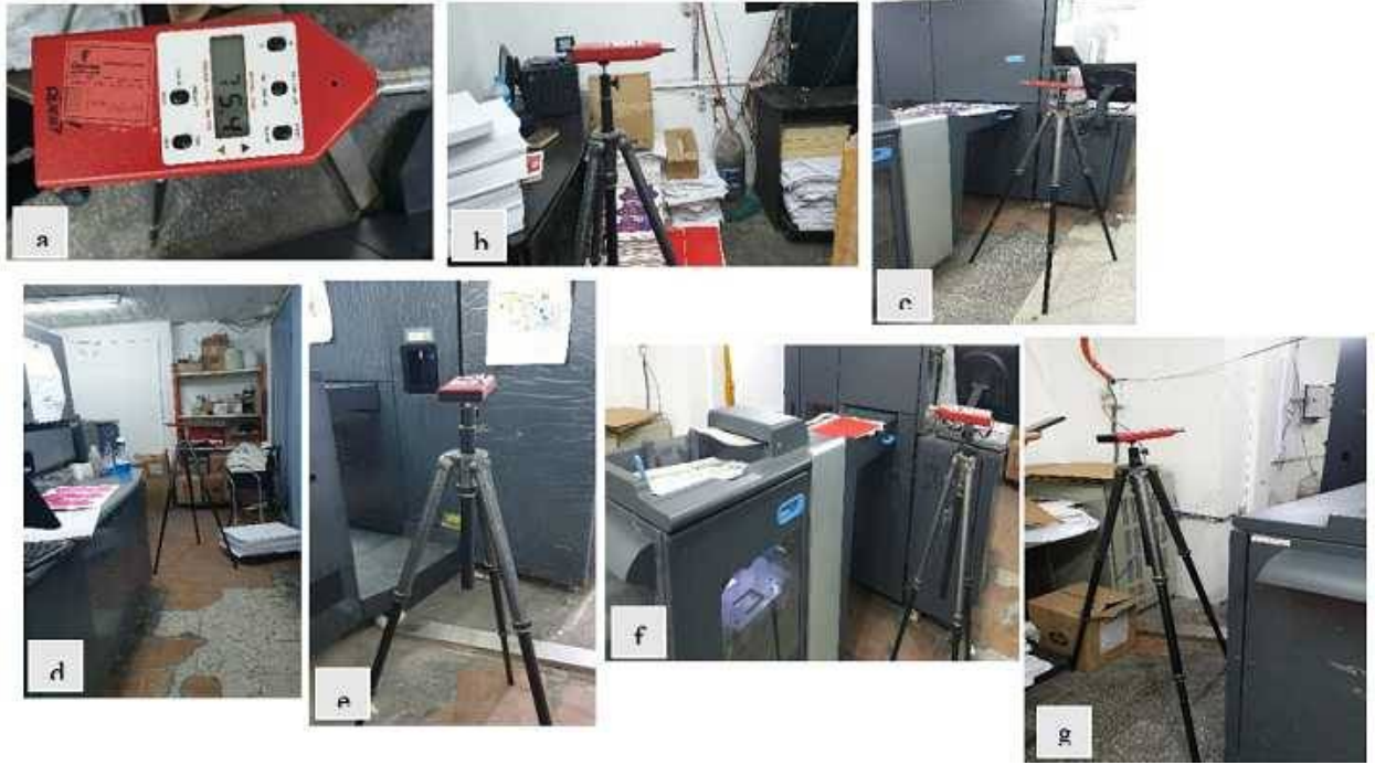
Figure (3): The experiment on site (room 2) while measuring sound levels: a) Two Xerox WorkCentre 5875 Digital printing presses , b) HP Indigo 7800 Digital Press Chiller , c) both of machines set – up places

8/6/2: Sound pressure level were collected as in table (3) in 2 points near HP Indigo 7800 Chiller located in fig (3), measurements were taken over a period of 5 minutes per each point, each minute has its own level equal of 5 noise levels for each point. No alarm has been found. Measures has been made about 3 meter far from the chiller point, in which the worker most movements