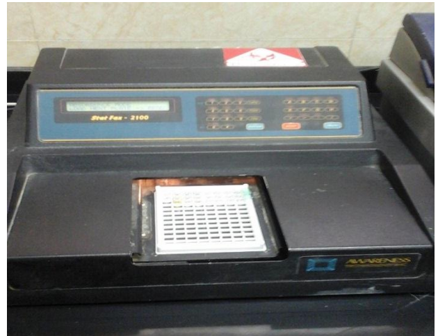
Figure 1: Starfax 2100 device