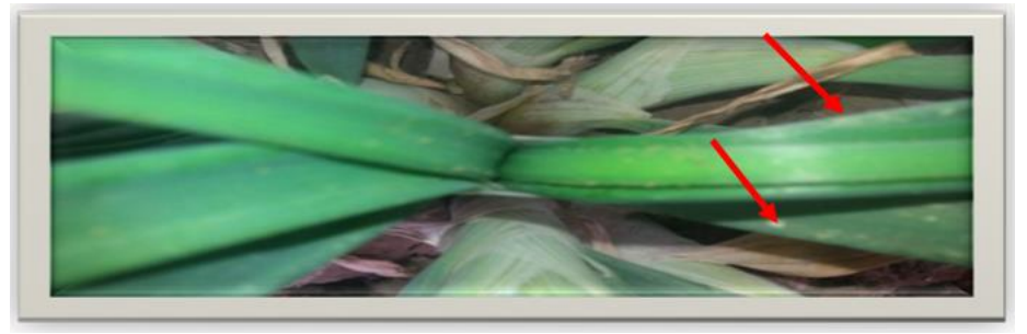
Fig. (4): The damage occurred to bulbs of the onion plants by the infestation with the onion thrips, T. tabaci .