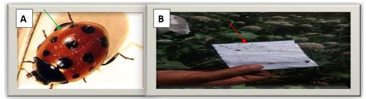
Fig. (2): The release of the two common predators; C. undecimpunctata adult in a cup (A) and the green lacewing larvae of C. carnea in a paper cart (B), in the experimental areas of the greenhouses, during the two successive seasons 2018 and 2019, in Sohag Governorate.

Fig. (1): The experimental areas that were cultivated with the onion plants, in greenhouses located in Sohag Governorate.( A )The greenhouses in which the onion plants were cultivated. ( B )The period of the onion plants flowering at which the three experiments were made.