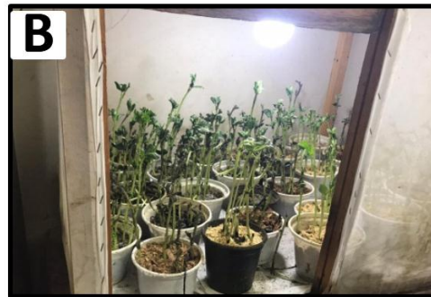
Plate (1):- A: Broad bean seedlings grown in pots and heavily infested with A. craccivora B: Muslin cage, for mass-production of aphids