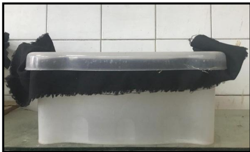
Plate (2): Plastic container used for rearing adults.

So, enough quantities of aphids and larvae of Ch. carnea were always available for achieving the desired experiments.