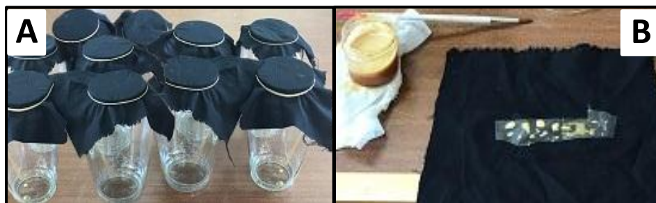
Plate (5):- A: Glass chimney cage in each of them placed a pair of adults. B: Black cloth, in the middle of the cloth, a sticker has been placed that contains the diet for feeding.

Daily observations were done to record number of eggs (fecundity), percent of egg hatching, the incubation period, percent survived larvae, larval duration, percent pupation, pupal duration, percent adult emergence, sex ratio, adult longevity, per-oviposition, oviposition, and post-oviposition periods.