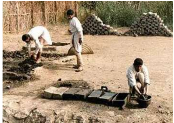
Fig. 4. Mud-Brick made

Using mud-brick building materials is one obvious way construction that typically found in old rural areas of Egypt to reduce the cost of poor villagers, Fig. 4.