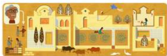
Fig. 6. Hassan Fathy experimental at rural Egypt

Figure (6) illustrates Hassan Fathy's experiment at rural Egypt. Fathy had worked with traditional forms such as domes and vaults by the use of local materials (mud brick) to build low cost housing in the village of New Gurna (west Luxor, Egypt).