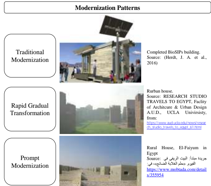
Fig. 1. Modernization patterns in the building constructions from sustainability perspective

Based on the above, Fig. 1. illustrates that modernization patterns in the building constructions from sustainability perspective that can be divided into three categories: traditional, rapid gradual transformation and prompt modernization.