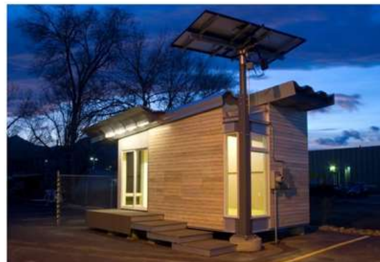
Fig. 8. Completed BioSIPs building